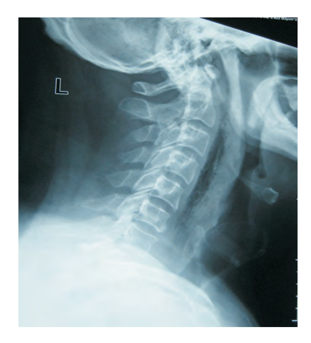
Figure 1: lateral soft tissue neck x- ray showing air in retropharyngeal space.

Early recognition and treatment is of paramount importance in order to prevent mortality. Laryngeal mask airway, although considered safe, may still lead to perforation. Thorough evaluation of the difficult airway and atraumatic performance of direct laryngoscopy and intubation are mandatory.