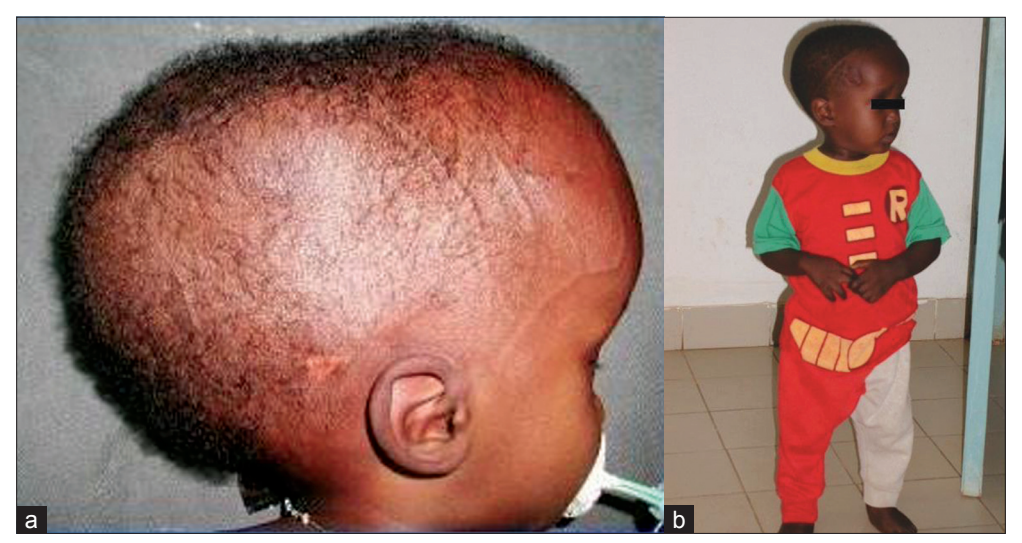
Figures 2: (a,b) Baby four months before bypass and at the age of five years

Sanoussi, et al.: Using 'catheter à fentes' for childhood hydrocephalus