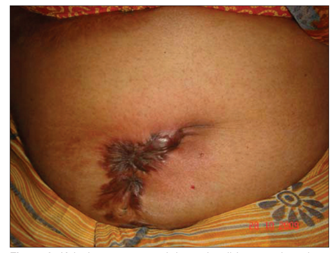
Figure 2: Keloid over anterior abdominal wall having tuberculosis verrucosa cutis

Microscopically, histological pictures represent hyperkeratosis and acanthosis. Beneath the epidermis there is usually an acute inflammatory infiltrate. Abscess formation may be observed in the upper dermis. In mid-dermis tubercular granulomas, moderate amount of necrosis is usually present. Tuberculous bacilli are more numerous in the disease and can be demonstrated by ZN staining. Other forms of cutaneous tuberculosis are lupus vulgaris, scrofuloderma, tuberculosis cutis