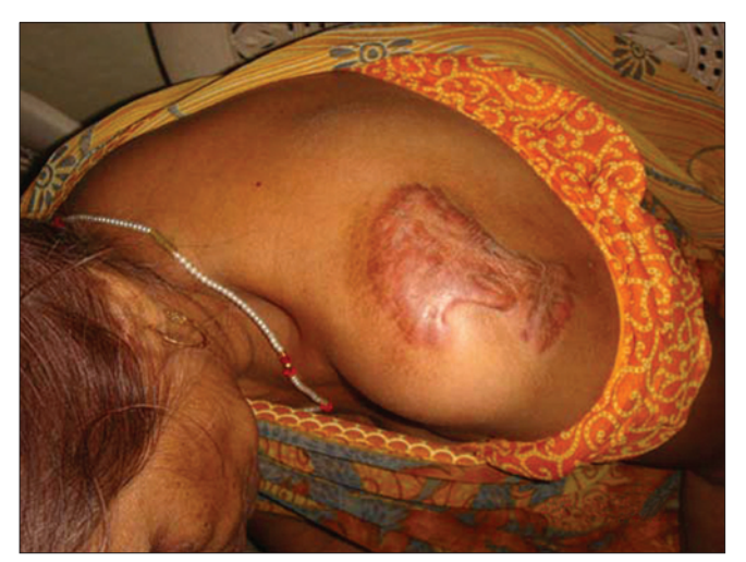
Figure 1: Patient having keloid over back