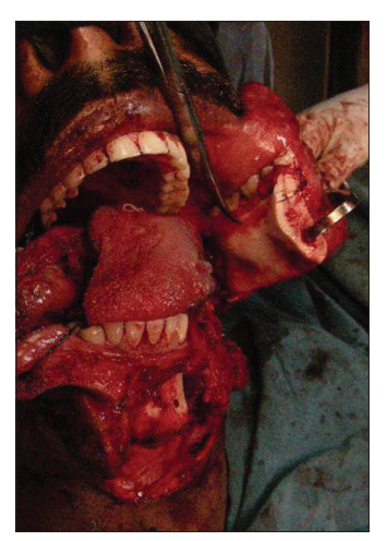
Figure 1: Intraoperative photograph showing the mandible where the gingival mucosa is removed as part of the margin of resection