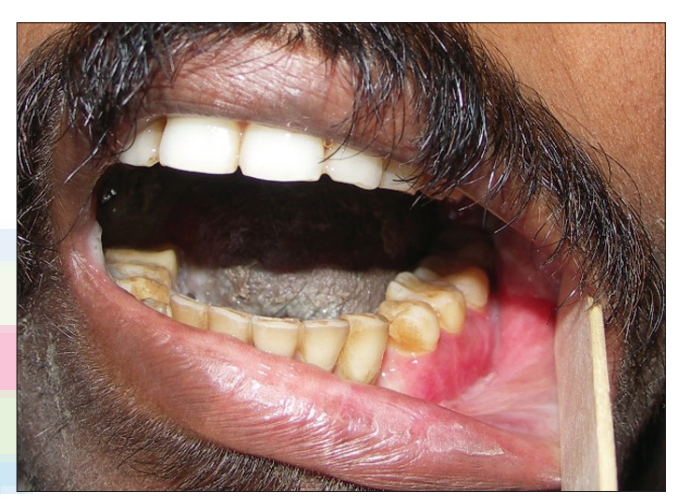
Figure 4: Final outcome after 6 months

after resection in oral cavity tumors usually requires cutaneous flaps. [2] Free flaps [3] or pedicled myocutaneous flaps [4] are commonly used. In these instances, the flap has to be hitched to the adjacent teeth to get an adequate seal. Surgical textbooks do not describe a technique of doing this nor could a literature search find one. The reported technique was used in 10 patients of oral cavity tumors who required flap reconstruction and was found to be useful. The commonly done technique of hitching the flap is with a single loop around the tooth and a single knot. Our technique is innovative in the second bite on the adjacent mucosa and the knot which prevents the slipping of the suture from the tooth.