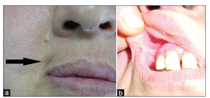
Figure 1: (a,b) A 56-year-old woman presented with a scar in the right upper gingivobuccal sulcus, involving the right commissure of the mouth

Tuncel, et al.: The use of nasolabial island flap