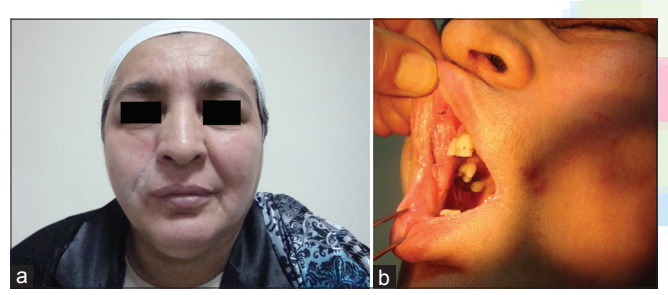
Figure 3: (a) Early postoperative result at one month. Some edema is present around the modiolus. (b) The appearance of the flap in the mouth was considered to be satisfactory

The main advantages of the flap in facial reconstruction are its accessibility, ease of dissection, good color match, and minimal donor site morbidity. Evaluation of the depth of the sulcus is important for the mobility of the tongue, which is paramount in proper speech, therefore, integrity of the sulcus and sufficient reconstruction is necessary.