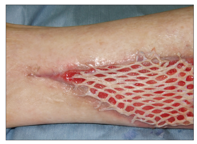
Figure 2: The dendritics of the mesh skin graft were affixed using Dermahond

We used Dermabond for the pasting of meshed skin grafts. This technique spares the dendritics, which are usually trimmed or useless. The fixation time is equivalent to surgical stapler fixation and the removal of sutures is