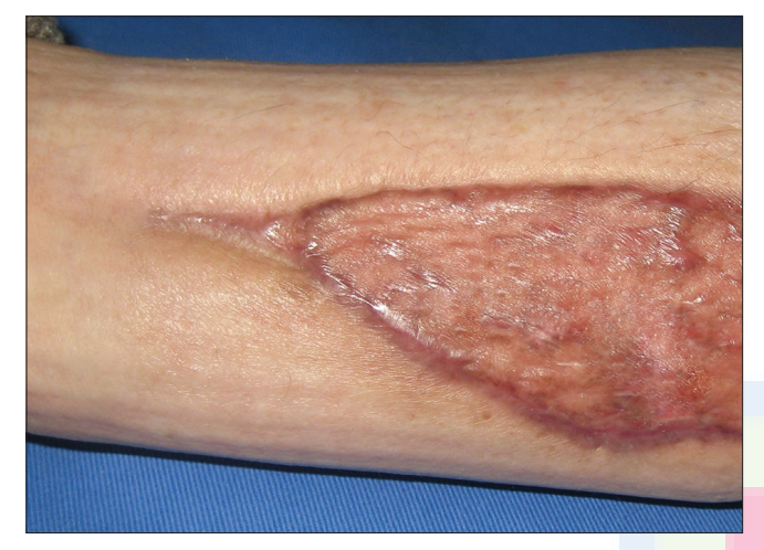
Figure 3: Six-month postoperative result

Dermabond was initially used to replace the suturing of superficial wounds, but it is currently used in a variety of techniques. [1] Dermabond has been used recently as a skin bolster to assist the primary closure of wounds in patients with thin skin. [2]