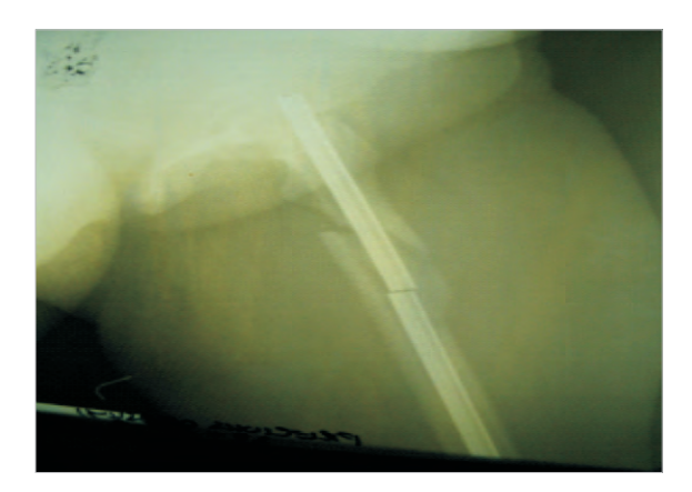
Figure 1: Pre operative X-ray (Anteroposterior view

A female, 28 years old, presented with a history of pain at the upper part of her left thigh. She had fracture of the left femur following a road traffic accident three years before presentation. She had been operated upon twice by the same surgeon who .had to replace a broken Kuntscher nail (K-nail). Radiograph (Figure 1) confirmed that the second K-nail had also suffered fatigue fracture.