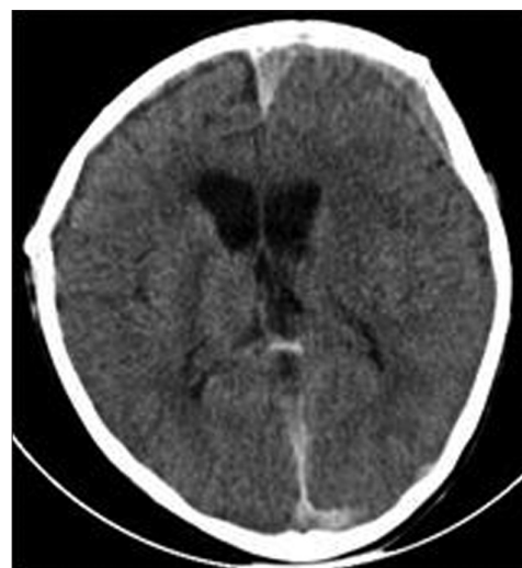
Figure 5: Postoperative contrast CT at eight weeks. There was re-expansion of the right frontal lobe