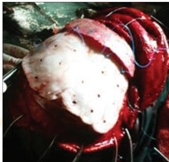
Figure 3: Intraoperative image of the patient. After removal of the pathological bone, cranioplasty with molded methyl methacrylate was carried out. The implant was kept in place with a Nylon 1 suture