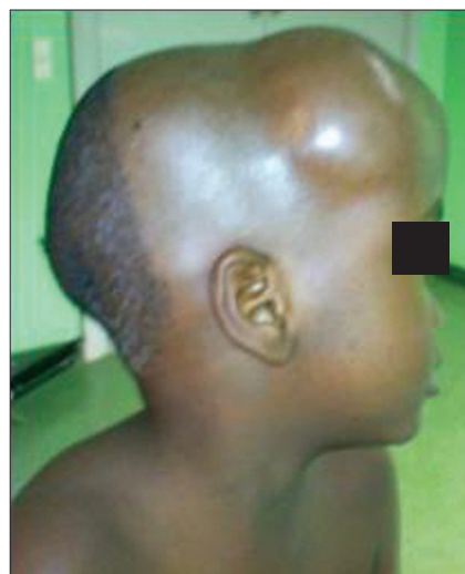
Figure 1: Preoperative picture of the patient showing a large right frontal swelling

Laboratory investigations, which included hemogram, electrolytes, and urea, were all within normal limits. A preoperative brain CT scan showed a huge right frontal extradural, which was enhanced with contrast administration. It had a central cystic component and a