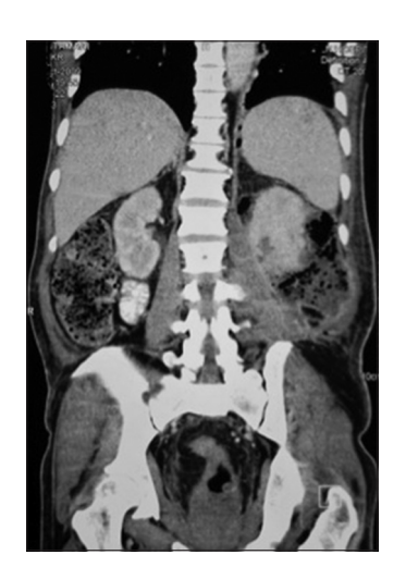
Figure 1: CECT with coronal reconstruction showing emphysematous pyelonephritis of left kidney

A 30-year-old obese lady presented to the surgical emergency with history of pain in the right upper