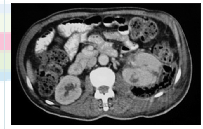
Figure 2: CECT showing emphysematous pyelonephritis of left kidney

abdomen and back, with a history of on and off fever and generalized ill health for the past 2 weeks. She was a known diabetic but was on irregular treatment and poorly controlled according to the records available. Examination showed the patient to be febrile, along with tachycardia of 110/min. The patient was normotensive at admission. The patient was pale but had no other significant finding on general physical examination. Examination showed an ill-defined tender lump occupying the right lumbar and hypochondrium of approximately 10 \times 8 cm size. Because of the tenderness and obesity of the patient the characteristics of the lump could not be elicited fully. Hematological investigations showed a hemoglobin of 5 g/dl and total count of 13,000/mm<sup>3</sup>. Biochemical investigations showed a blood sugar of 350 mg/dl with ketonuria, deranged blood urea (100 mg/dl) and serum creatinine (3 mg/dl). X-ray of the abdomen revealed air lucencies along the right psoas muscle, but no free air under diaphragm. Because of suspicion of emphysematous pyelonephritis, a CT scan was ordered and this revealed the right kidney enlarged with multiple air lucencies in the