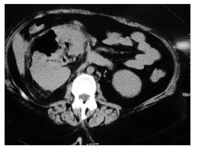
Figure 3: CECT showing emphysematous pyelonephritis of right kidney

abdomen and back, with a history of on and off fever and generalized ill health for the past 2 weeks. She was a known diabetic but was on irregular treatment and poorly controlled according to the records available. Examination showed the patient to be febrile, along with tachycardia of 110/min. The patient was normotensive at admission. The patient was pale but had no other significant finding on general physical examination. Examination showed an ill-defined tender lump occupying the right lumbar and hypochondrium of approximately 10 \times 8 cm size. Because of the tenderness and obesity of the patient the characteristics of the lump could not be elicited fully. Hematological investigations showed a hemoglobin of 5 g/dl and total count of 13,000/mm<sup>3</sup>. Biochemical investigations showed a blood sugar of 350 mg/dl with ketonuria, deranged blood urea (100 mg/dl) and serum creatinine (3 mg/dl). X-ray of the abdomen revealed air lucencies along the right psoas muscle, but no free air under diaphragm. Because of suspicion of emphysematous pyelonephritis, a CT scan was ordered and this revealed the right kidney enlarged with multiple air lucencies in the