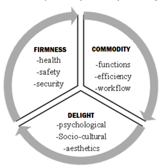
Fig. 1: Extract from habitability framework (Preiser 1988)

Preiser, (2001) further explained that the three levels that parallel the standards and guidance for designers to avail themselves to were: