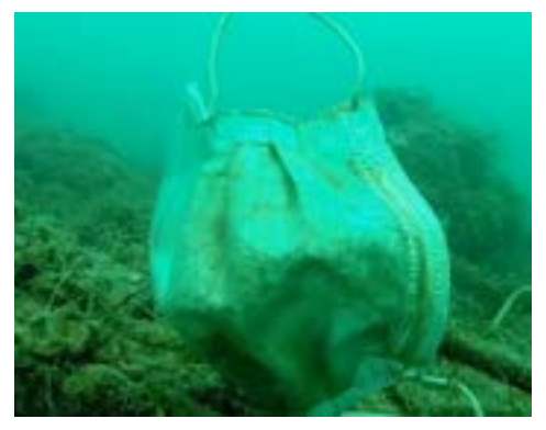
Fig 1: Mask Pollution

debris in the aquatic ecosystems (Weforum, 2020).