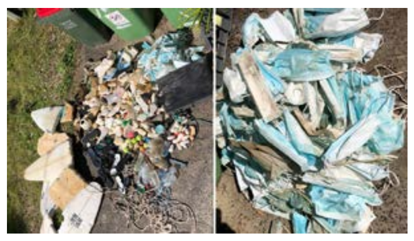
Fig. 3: Mask Waste from New South Wales (NSW) Beach

environmental conditions (Fadare and Okoffo, 2020).