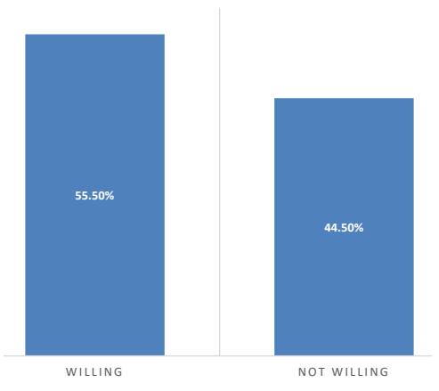
Figure 1a Willingness of Pregnant Women to Donate Human Breast Milk

Figures 1a and 1b provide results on the willingness of pregnant women to donate and utilize breast milk from the human milk bank. The results indicated that a little over half (55.50%) of the study participants were willing to donate their breast milk to the human milk bank. Meanwhile, only 33.6% were willing to accept and use donor human breast milk to feed their infants.