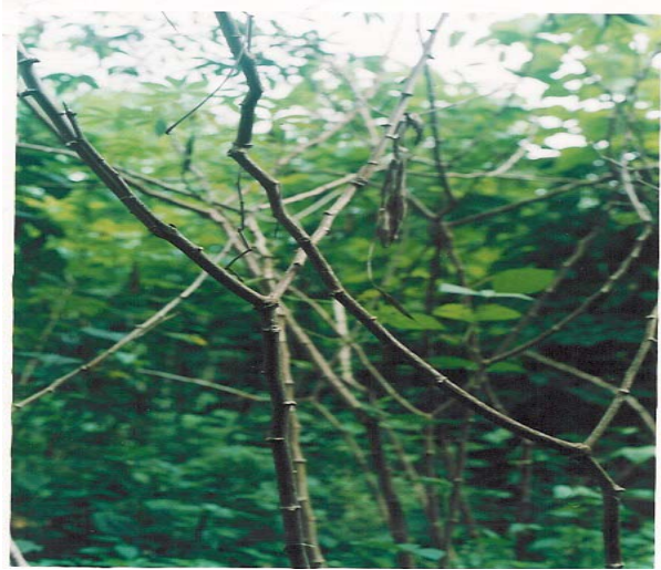
Plate 2: Manihot Esculentas (Cassava)