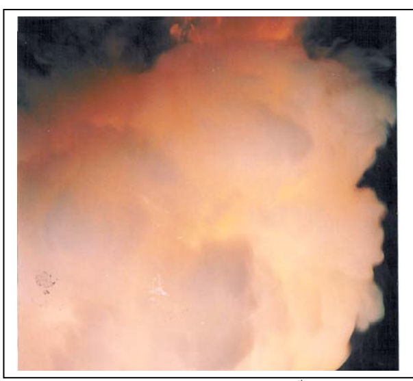
Plate 6a: Ignition of Foreign black powder(1<sup>st</sup> Trial)