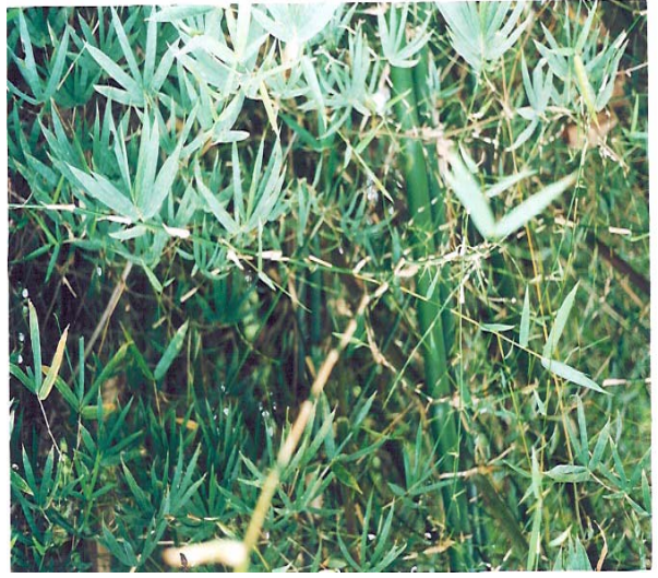
Plate 1: Bambussa Spp (Bamboo)