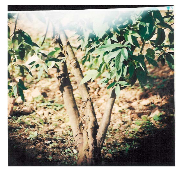
Plate 3: Cajanus Cajan (Pigeon pea) tree)