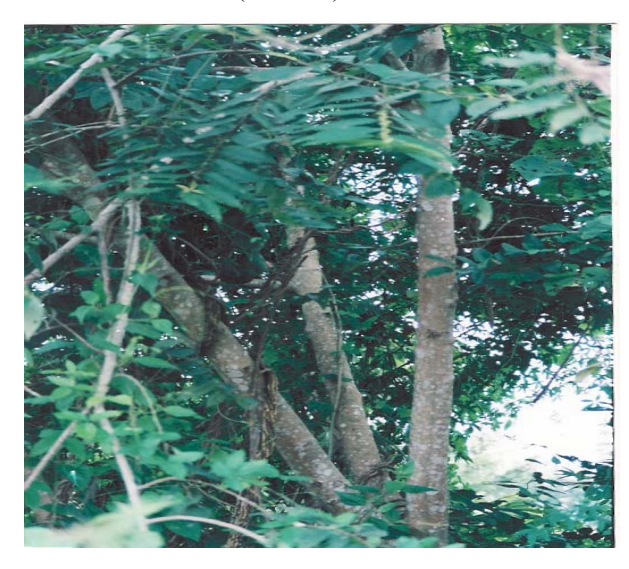
Plate 4: Trema Orientalis (Charcoal