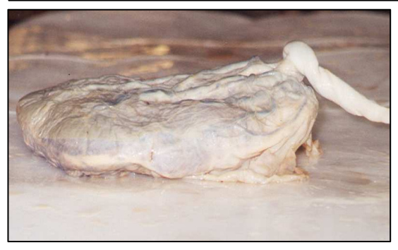
Plate 3: a photograph of an umbilical cord with marginal attachment to its placenta

Morphological variations of the "Baby's Supply Line"