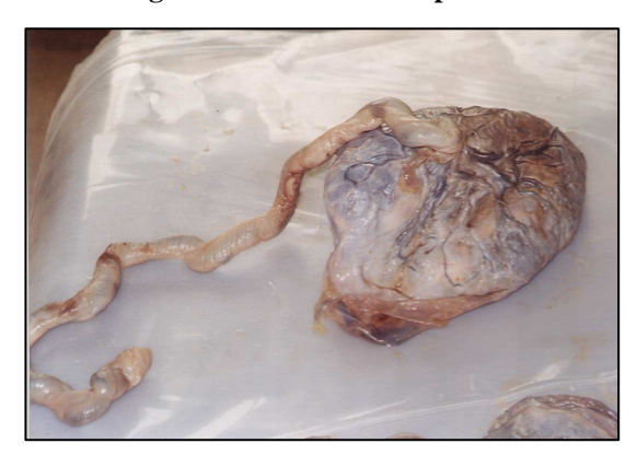
Plate 4: a photograph of an umbilical cord with eccentric attachment to its placenta