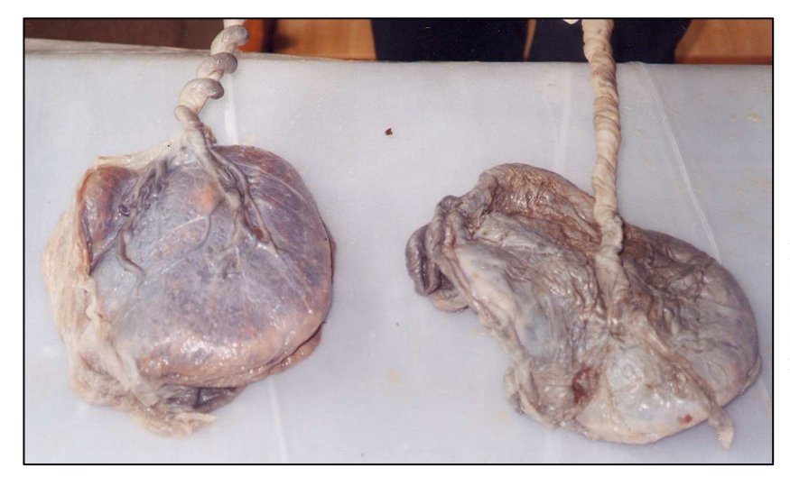
Plate 5: a photograph of two umbilical cords showing furcated insertion (left) and nonfurcated insertion (right)

In the present study cords less than 40.0cm were classified as short, those greater than 40.0 cm were categorized as long. Based on this criterion there were more long cords (78.44%) than short