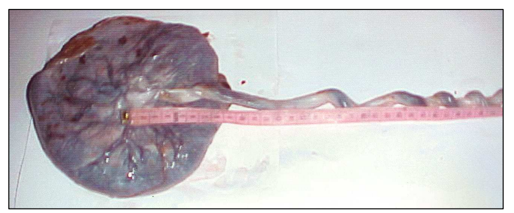
Plate 1: A measuring tape alongside an umbilical attached to its placenta

was also recorded. The insertion point of the cord in relation to the placenta, was located and described as either centric, eccentric or marginal. The insertion of the umbilical vessels into the placentae was examined and described as either furcate (when the vessels were separated from each other before their insertion) or non-furcate (when they were covered by a sheath of Wharton's jelly to their point of insertion). The number of vessels in each umbilical cord was counted and recorded by snipping a bit of each umbilical cord and observing the number of lumina present. The cords were critically examined for knot formation and recorded.