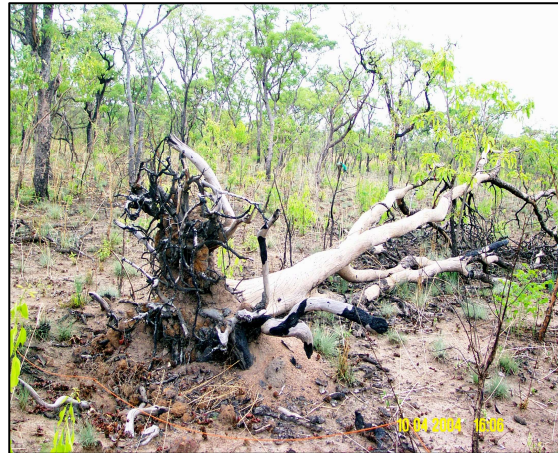
Plate 1: Burkea africana tree toppled by wind and subsequently burnt by fire. Note the tall trees of Burkea africana in the background

cally, a chi-square test of independence was conducted with the expected frequency assigned on the basis of a 33⅓% probability that the severity of scar damage would be any one of the three classes. The test was highly significant ( \chi^2 = 40.34 ; d.f. = 2; p < 0.001 ), supporting the statement that scar class iii was the most frequent or that a greater proportion of the basal scars had reached an advanced stage. Some of the scars were over 5 m high (Plate 3), while the majority of them were up to about 1.5 m high.