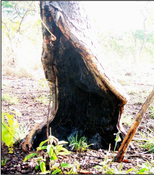
Plate 2: Moribund Detarium microcarpum tree with severe basal scar ('class iii'). Tree may easily be blown over by wind or fall under its own weight