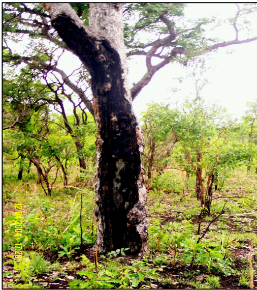
Plate 3: Living Daniellia oliveri tree with severe fire scar. Note the height of the scar from the ground