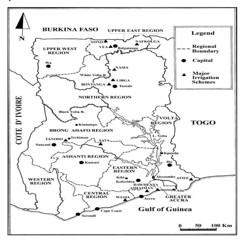
Fig 1: Major irrigation schemes in Ghana: Tono in Upper East Region