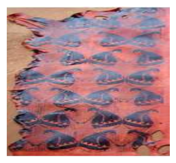
Plate 3: Printed motifs on wine leather

and has debunked the perception that the technique of vat dye applications has been considered to be the preserve of textile printers and fabric dyeing. Plates 4 and 5 illustrate finished leather artifacts made from the red and wine leathers screen printed with the indanthrene dyes.