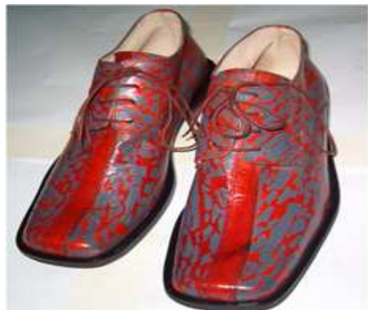
Plate 4: A pair of printed leather shoes