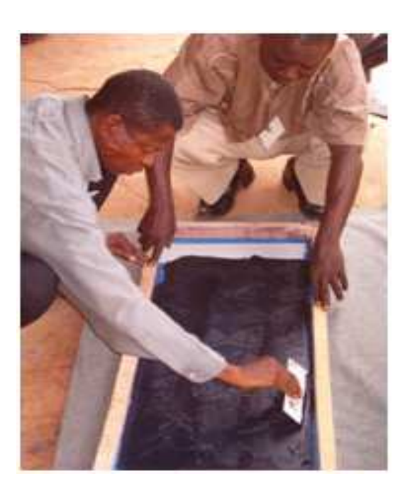
Plate 1: Screen printing on leather

In preparing the indanthrene dyestuff solution for experiment 2, the following varied quantities of dye, reducing agents and water were used as shown in Table 1: 0.04g of light blue vat dye, 0.01g of caustic soda and 0.12g of sodium hydrosulfide were mixed with 150ml of hot water (90°C) in a plastic container. The