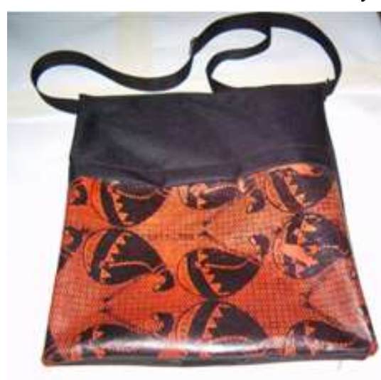
Plate 5: Printed ladies shoulder bag