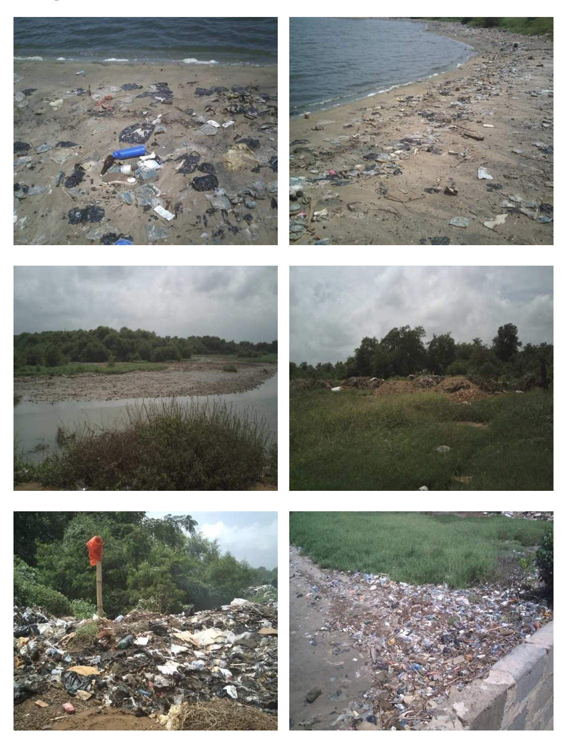
Fig. 2: Plates showing various sections along the lagoon