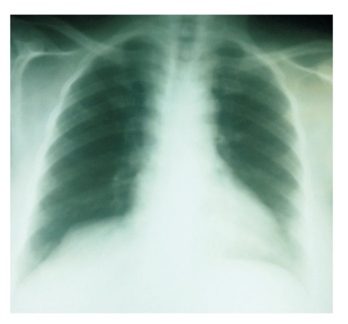
Figure 2: Showing chest Xray