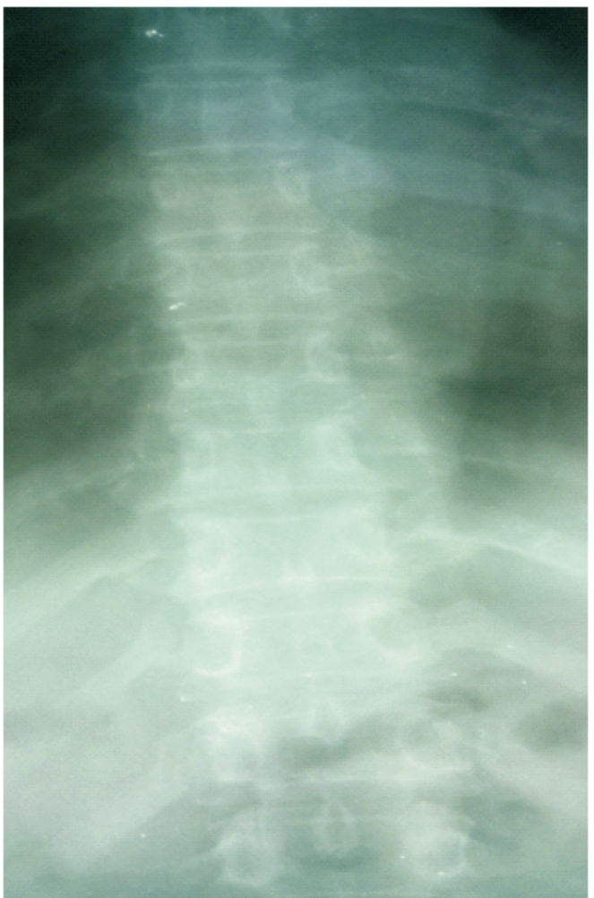
Figure 3: Showing the Xray of spine