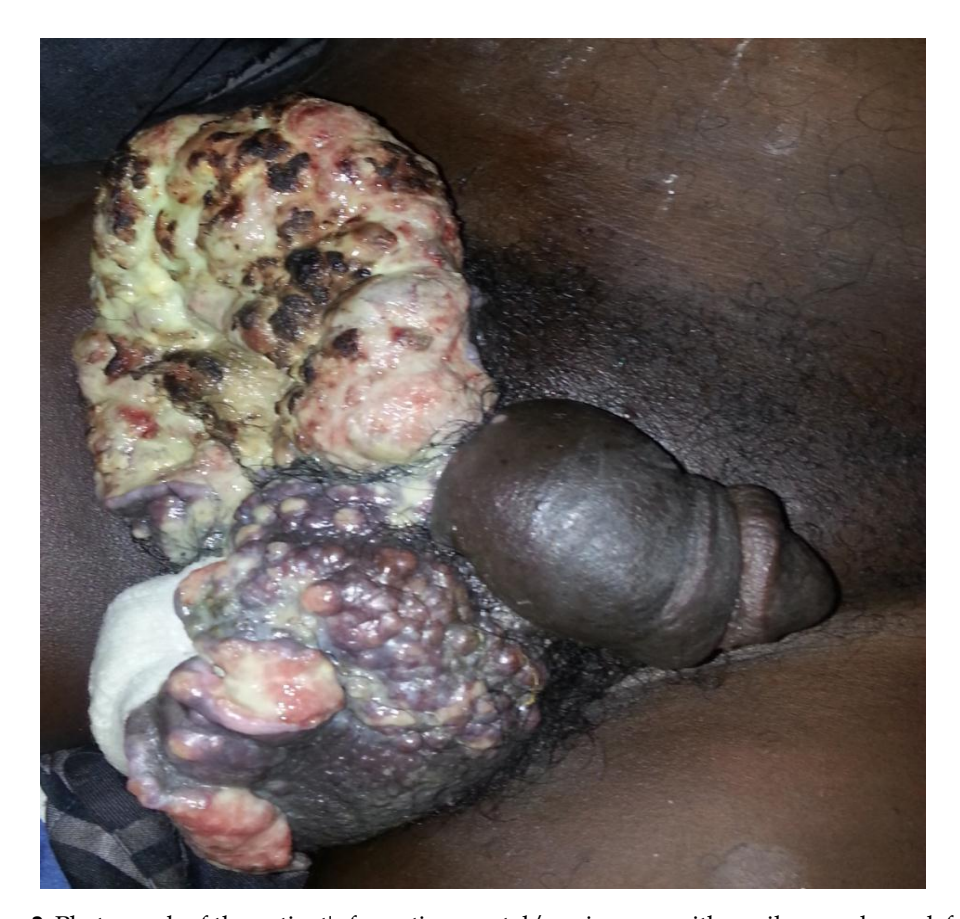
Figure 2: Photograph of the patient's fungating scrotal/ groin mass with penile saxophone deformity.