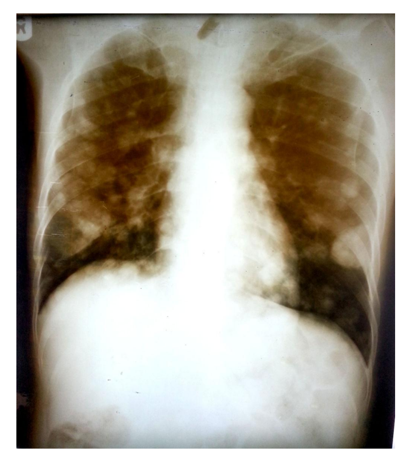
Figure 5: Plain Chest radiograph showing multiple areas of opacities in the lung.