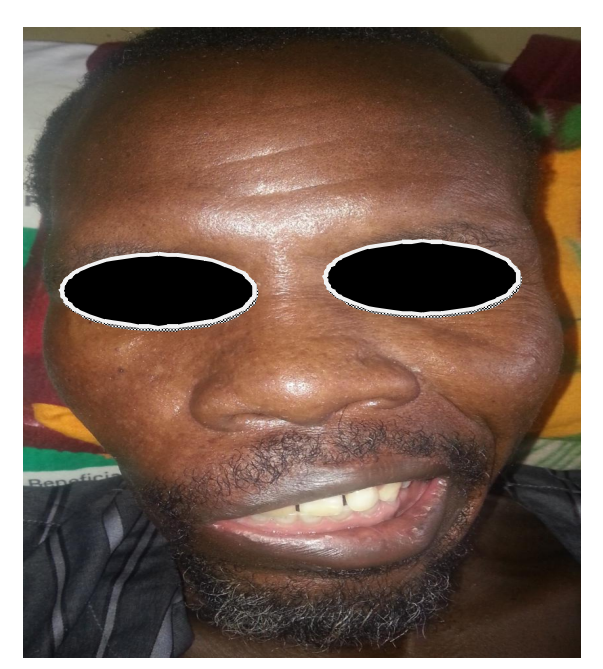
Figure 1: Photo image of the patient revealing right grade III facial nerve palsy.

temporomastoid region revealed retroperitoneal lymph nodes and fallopian canal deposits respectively (Figure 4). His plain chest radiograph showed multiple areas of macro radio-opacities with an irregular broad-based radio-opacity on the left lower zone of the lung (Figure 5). The patient was optimized; he had two units of whole blood transfused with tetanus prophylaxis and was maintained on antibiotic, analgesic, adequate hydration and twice daily wound dressing. The PCV was 31.9%, White cell count was 13.3 \times 10^9 / l , Platelet was 442x10<sup>9</sup>/l, renal function test, liver function tests, serum calcium and phosphate (Ca<sup>2</sup>+, PO<sub>4</sub>+) were normal ranges but the albumin was at the lower range of normal. Urine microscopy, culture and sensitivity yielded no growth, no larvae of Strongyloides stercoralis nor were other parasite seen on stool microscopy. His performance status was approximately 60 %( Karnovfsky score). He was counseled on his condition and he consented to palliative chemotherapy. He tolerated the first course of a combination of Cisplatin, Etoposide and Bleomycin (BEP). Unfortunately, five days after completing the first course he developed a sudden difficulty in swallowing while having breakfast. Thereafter he lapsed into unconsciousness with persistently unexplained fall in blood pressure and finally ceased breathing notwithstanding the resuscitation effort. Possible cause of dead was tumour emboli to the brain.