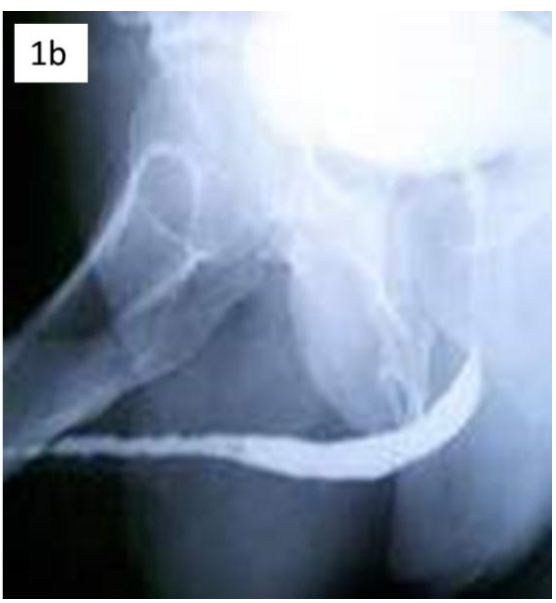
Figure 1b: Urethral stricture on RUG