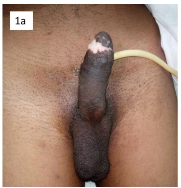
Figure 1a:Lichen Sclerosus around the glans.

Intra-operative findings revealed a 4cm long area of fibrosis involving the dorsal aspect of the distal penile urethra, which was excised out. Buccal Mucosal Graft (BMG) was harvested quilted, meshed and sutured on the raw area dorsally and the urethra was sewn to the graft on a stent and wound closed in layers as shown in figures 2a, 2b, 2c, 2d and 2e. Post-operative condition was satisfactory. Urethral catheter was removed after 3 weeks with a satisfactory urine flow rate of 15mls/second. The urine stream remained good 1 year postoperative as shown in figure 2e. Findings from the histology of the excised tissues include hyperkeratosis, stromaloedema of the basal cells, bands of hyalinization and angiectesia as shown in figures 3a and 3b. This is in keeping with Lichen sclerosus.