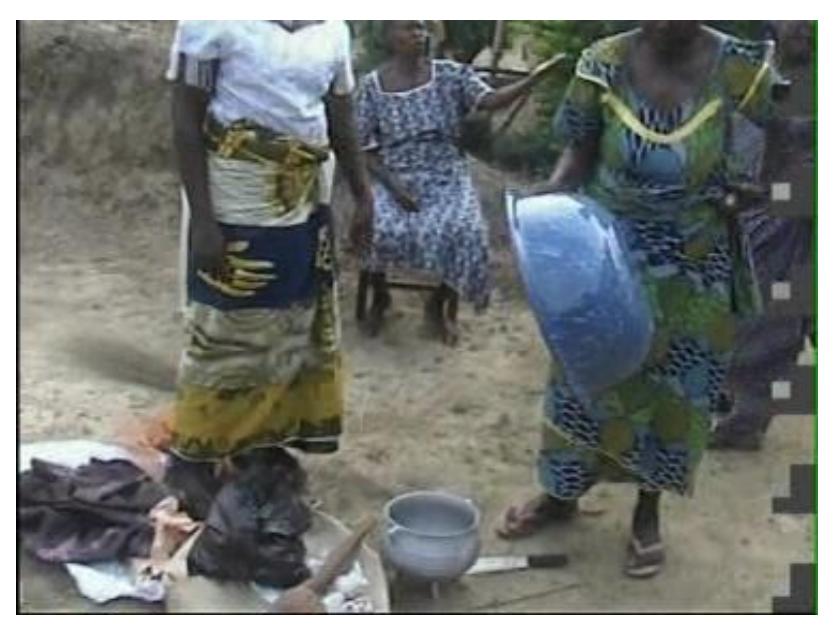
Fig. 3. The umuada preparing props for a burial dance.

the woman has duties that include the preparation of meals during festivals and title taking events in her consanguine community. It is also their duty to prepare ritual items and props used in the performance of female burial dances (Fig 3). There are other duties which the ndiomu are expected to perform but which cannot be exhausted in this seminar. What is important to remark here is that the umuada of Osomala, continues to attend the dance sessions expected of every umuada . She will also be expected to assume her position as ada-uku (the eldest woman or chief ada ) when such a time comes, provided she had reached menopause, she will be expected to return to her community and take up her position. In the event that she cannot, she will be expected to marry a substitute wife for her husband to fill her role in her absence. This is the first implication arising from her dual identity.