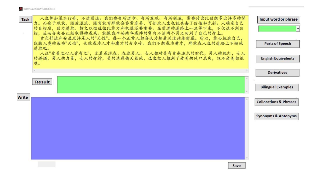
Figure 1: Screenshot of the CALL program

The interface of the CALL program is shown in Figure 1. The top box in the left colored yellow is the translation task. The bottom box in the left colored blue is the writing box. Between them lies the display box colored green. The top box in the right colored green is the search box. The six buttons under this search box are the labels of information categories. When users input a word into the search box and clicked on one information category label, the corresponding information for the word appeared in the display box. Like other electronic dictionaries, this search box also carried a function of association, that is, when users input letter "a" into the search box, a group of words beginning with "a" appeared in the pull-down list. This helped users locate the target word entries immediately. When the translation task was finished, users clicked on the save button below the writing box and the program saved the work.