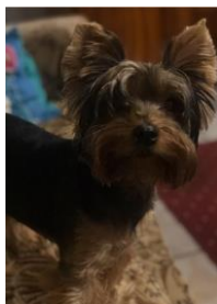
Figure 5: Picture of a typical Yorkshire terrier

A small dog, bred in the 19th century, Yorkshire England, height approx 20 cm, life expectancy approx 15 years, typical colour black turning to grey colour as it gets older.