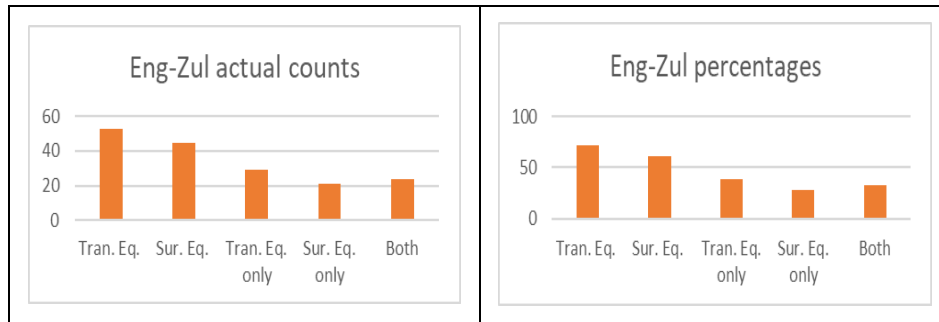
Figure 7: Translation equivalents and surrogate equivalents in -misdealings to -mitigate in EID

In total 194 equivalents were offered for the 74 lemmas treated of which 58, i.e. 29,9% were surrogate equivalents. Consider (8)–(10) as examples of treatment.