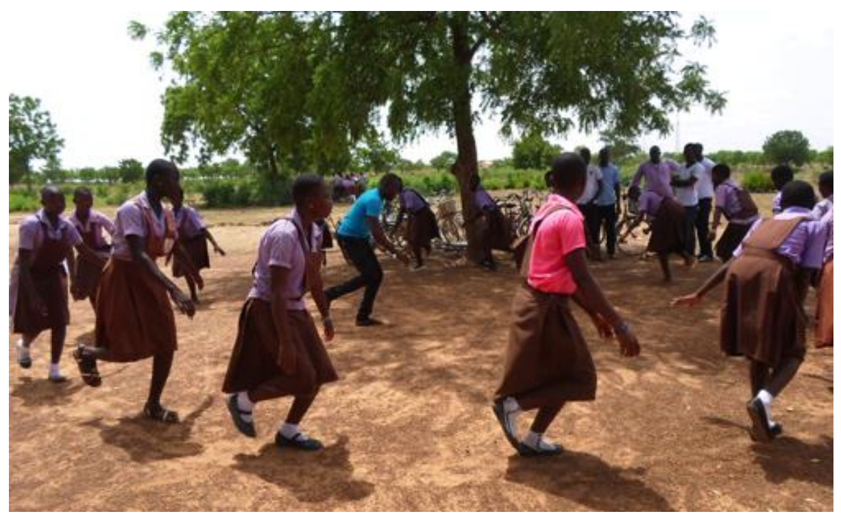
Figure 10: Training the Tolon group; a rehearsal on the school grounds.

strengthen social bonds as well as cultural continuity, providing a secure path for its own transmission into the future.