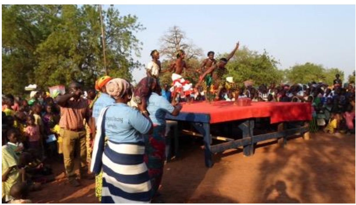
Figure 6: Dance drama performance in Ziong