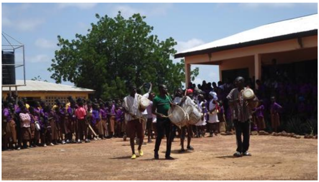
Figure 11: Inauguration day

Next steps involve qualitative monitoring and evaluation, including a longitudinal study design approach similar to that of Phase I. We plan to conduct several rounds of KAP surveys, completed by respondents selected at random from a variety of locations, including markets, community centers, and schools, at different times of the day, in order to assess improvements in health knowledge, attitude, and practice. We will also conduct focus groups with group members to record their reactions to the program, discover what they have learned, and gather feedback on the new groups, assess motivation and transmission, and gauge how their effectiveness and sustainability could be enhanced.