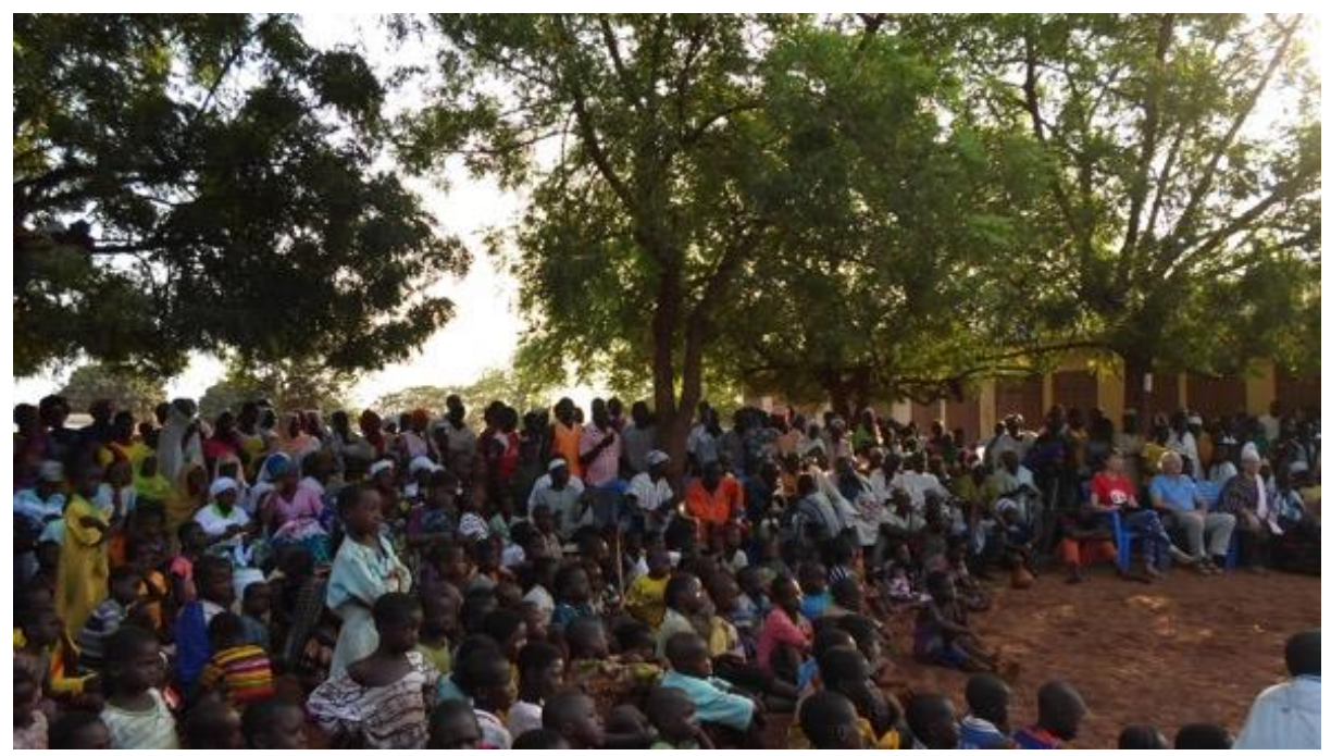
Figure 7: Attentive audience in Ziong; Zakus and Frishkopf visible at right.

The two professional comedic actors adeptly stirred the crowd through humorous antics, costumes, and gestures (as it turned out they were local celebrities, well-known through video films shown in local cinema houses). The audience also appreciated the skilful music and dancing displays combining traditional Dagomba dances with health-oriented gestures and lyrics. Many of these dances, though traditional, are no longer actively performed in Dagomba villages. Thus, for an afternoon these professional artists injected dazzling aesthetic color to the humdrum struggles of ordinary rural life, for which residents appeared most grateful. The performances were highly appreciated by all.