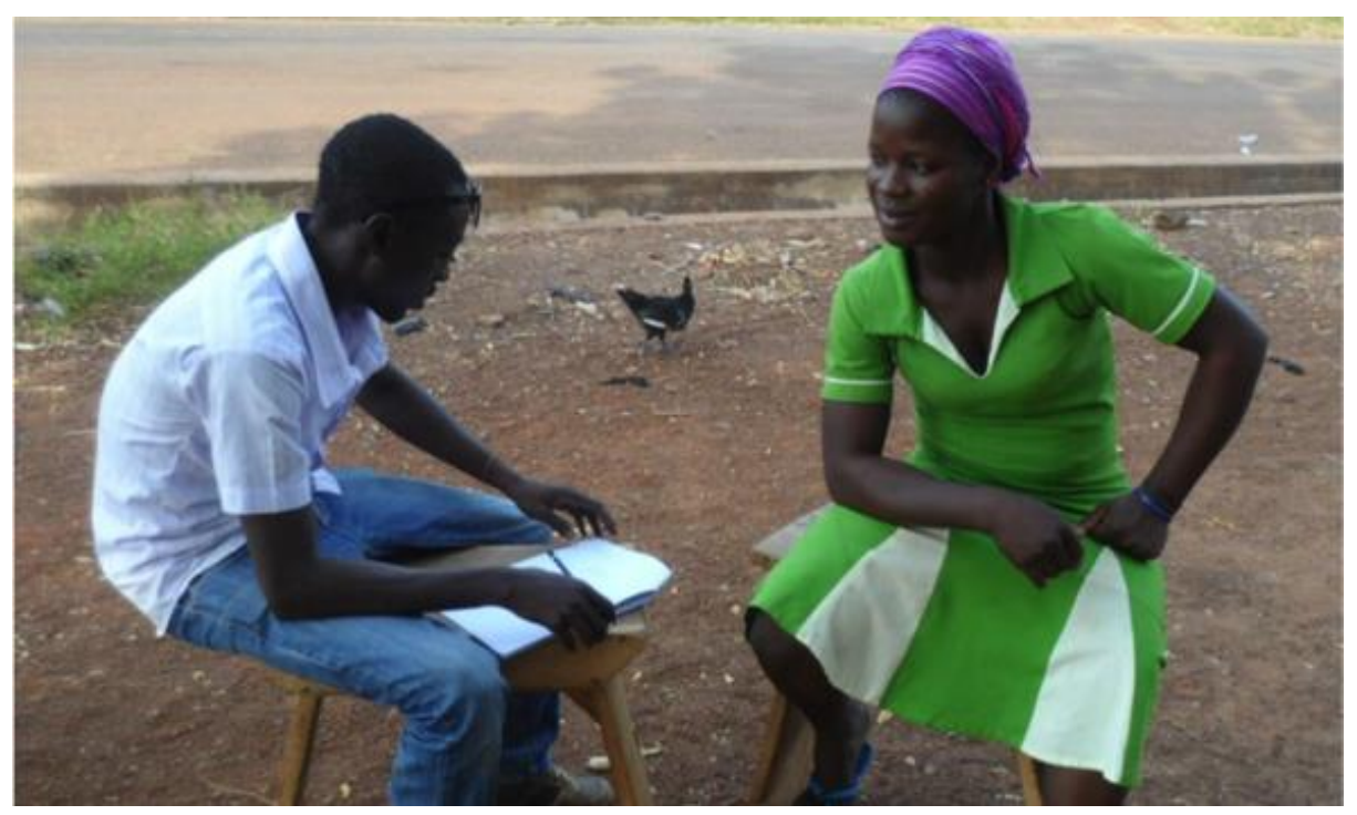
Figure 4: Surveying

Next, we performed the interventions themselves in December of the same year in the three villages, comprising one full afternoon in each village. Arriving in the morning, we set up the stage and sound system, strung up our banners and put up additional posters, thereby attracting attention. By early afternoon we were ready to begin. A parade of drummers and clowns through the village served to draw an enormous crowd to the performance ground (Figure 5). A DJ played popular music at high volume to attract more onlookers, and we opened each performance with a local village music-dance group. This was a strategy to integrate local performers into the project and connect with the communities through artistic exchange. There followed speeches from the opinion leaders we had contacted – the chiefs, imams, Ghana Health Service representatives, and elected officials – emphasizing the importance of the project. Our international team, including leading members of YHCG, gave short speeches as well. The two dance dramas (malaria and sanitation) were then presented in sequence (Figure 6). Each drama combined music and dance with dramatic narrative and comedy that kept the large audiences (an estimated 400 at each performance) focused, and often in stitches (Figure 7).