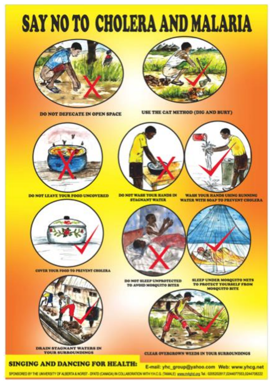
Figure 3: Poster for "Singing and Dancing for Health"

Meanwhile, we developed an elaborate Knowledge, Attitudes, and Practices (KAP) survey instrument (Warwick, 1983; WHO, 2008), which was vetted by statistical and survey research experts in Canada, and subsequently refined, translated and tested by the Ghanaian team. We carried out pre-intervention survey research in November 2014, sampling each adult village population at random for a total of 80 surveys per village, over the course of three days (each survey required nearly an hour to administer), attempting to obtain a random sample by soliciting interviewees at a number of places (school, market, homes, street) and varying times of day (Figure 4).