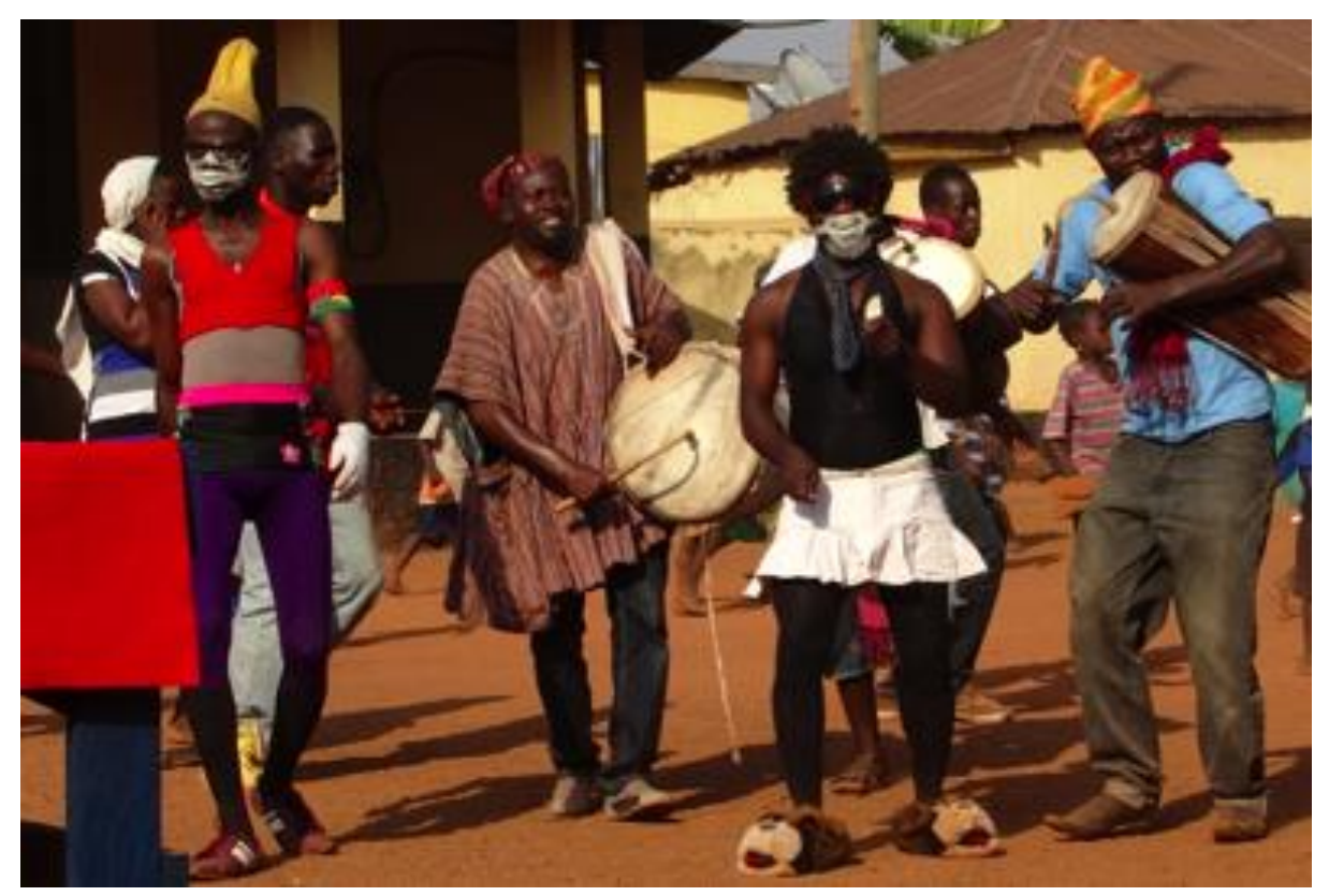
Figure 5: Clowns parade with drummers to gather a crowd