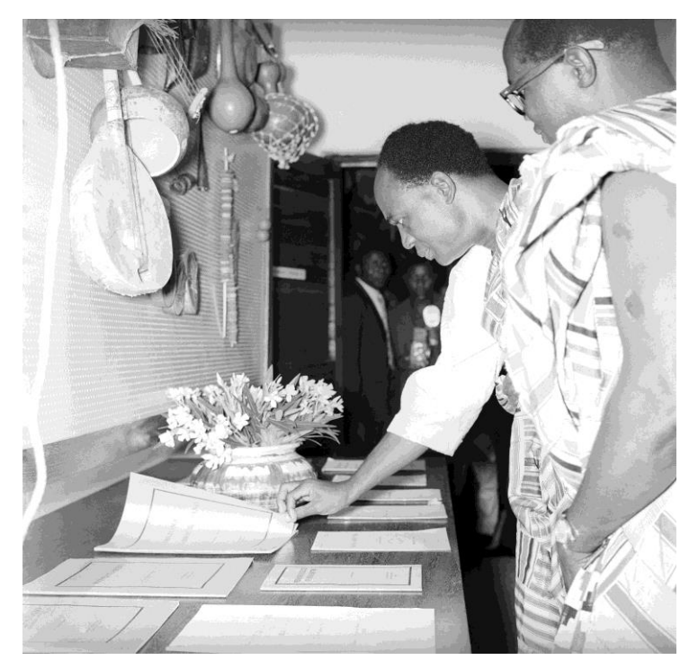
Fig. 2. Kwame Nkrumah in 1963 being conducted round the IAS facilities by J. H. Kwabena Nketia, in the foreground of photo, On the top left is the display of some musical instruments as part of the ethnographic collection.

Unfortunately, art studies in Ghana deal with a limited range of art history topics taught at the undergraduate and graduate levels to the neglect of the broader subject and its theoretical and methodological underpinnings of critical enquiry. The revised 1987 second cycle curricula introduced limited teaching of a general knowledge in art, which stimulated the publication of amateur second cycle school art books. Though this is significant to the development of the discipline, these books require a body to review their contents and illustrations.