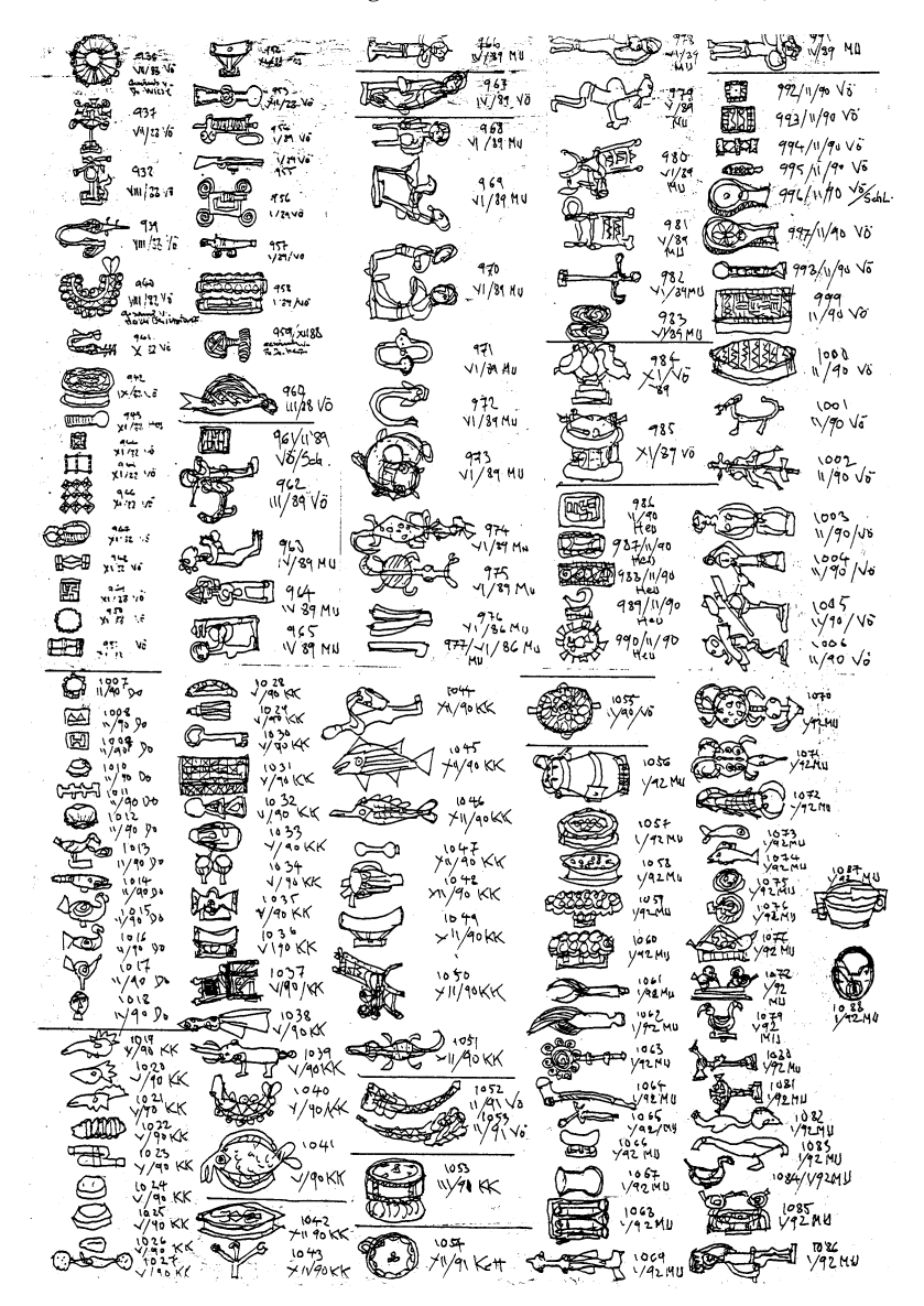
Fig. 3b. This photograph shows drawings and documentation of the collection by Mr. Dieter Röttger.