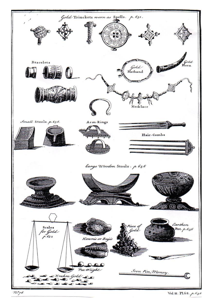
Fig. 1a. An assortment of jewellery, hair slides and other art forms used on the Gold Coast.