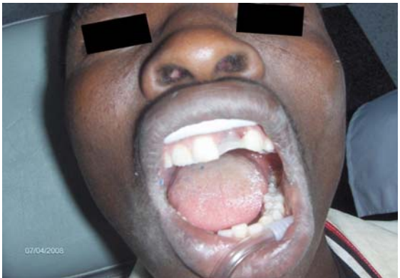
Figure 4. Appearance of FRC framework with layer of flow composite.

4. A bundle of resin impregnated glass fibers was cut and spread from the ends for increasing the bonding surface area (Fig. 3). The fiber bundle was placed so that the palatal surfaces of the adjacent incisors were covered with the fibers.