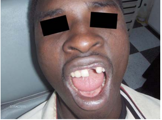
Figure 1. Frontal view of patient with missing central incisor.

TEGDMA, triethylenglycol dimethacrylate.