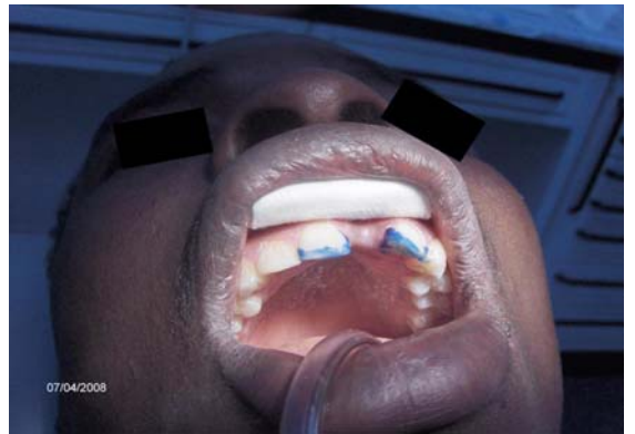
Figure 2. Etching of the palatal surfaces.