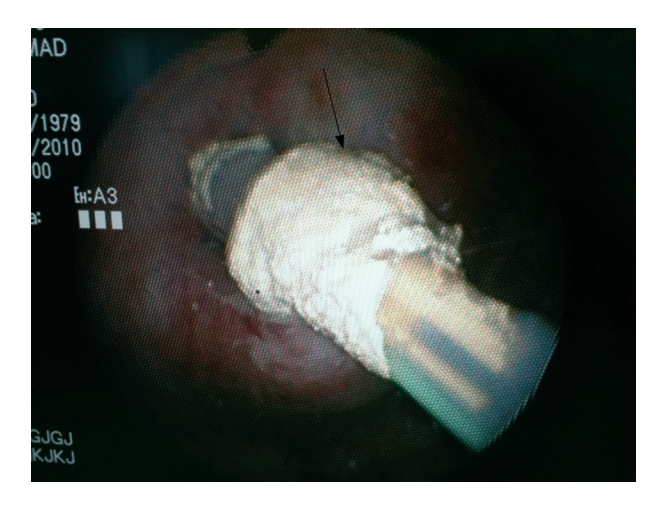
Fig. 2. The encrustation seen from the rigid cystoscope (arrow).

Encrustations can occur either in the lumen of the catheter or extraluminally. This can possibly result in blockage or retention of the catheter. The main cause of catheter encrustation is infection by urease-producing organisms, particularly Proteus mirabilis (2, 3). These organisms colonise the catheter, forming a bio film (4, 5). The bacterial urease generates ammonia from the urea, and the urine becomes alkaline. Under these conditions, crystals of calcium and magnesium phosphate are formed and a crystalline bio film develops, which eventually blocks the flow of urine from the bladder (6–8). The main route of infection of the catheterised urinary tract is through the urethra along the outer surface of the catheter. Infections, however, can occur from contaminants in the