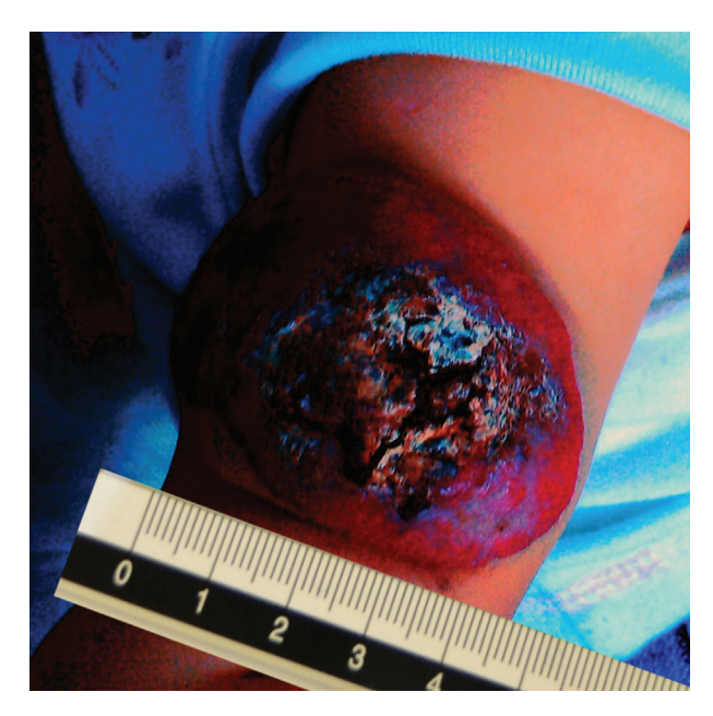
Fig. 1. Initial appearance of haemangioma prior to commencing oral propranolol.

ideas and results and, if these are confirmed, a paradigm shift occurs with the rejection of conventional theory and acceptance of the new standard. Breakthroughs commonly occur serendipitously in all branches of science including medicine. Serendipity is the propensity for making fortuitous discoveries while looking for something unrelated. An important aspect is the 'sagacity' of being able to link together apparently unrelated facts to