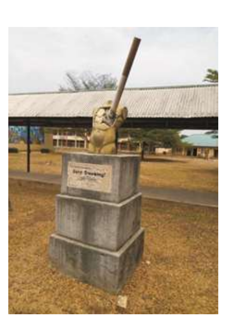
Fig. 1: "Stop Smoking" Medium: 3D Visual Art Artist: Rosemary Okon Year of Production: 2014