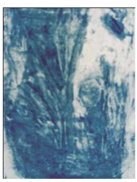
Fig. 2: "The Escape" Medium: Callograph Artist: Stella Idiong Year of Production: 2002

includes both asymmetrical and symmetrical motif patterns in its constituent parts as exemplified in 'Child Hawker'.