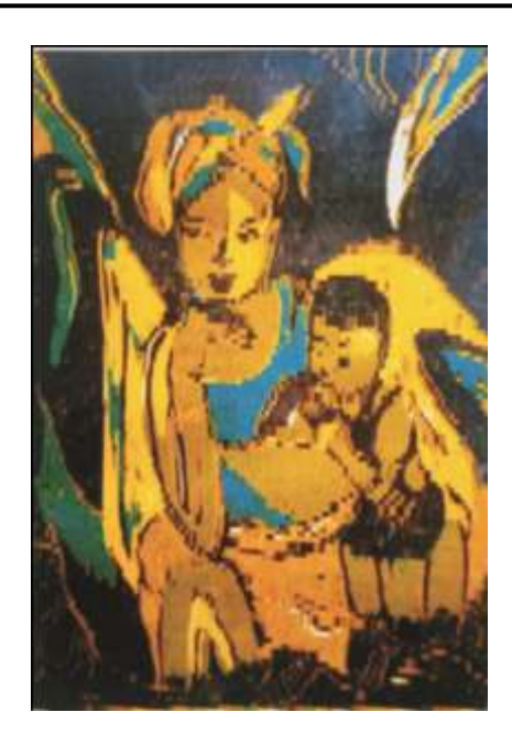
Fig.4: "Exclusive Breastfeeding"