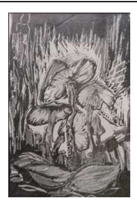
Fig.9: "Endangered Species" Medium: Wood Cut Artist: Stella Idiong Year of Production: 2003