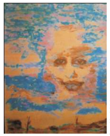
Fig.3: "Self Portrait II" Medium: Aqua Mono Artist: Stella Idiong Year of Production: 2002