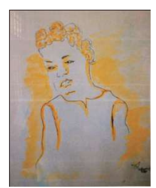
Fig.5: "Resting Baby Hawker" Medium: Contour Pen and Ink wash