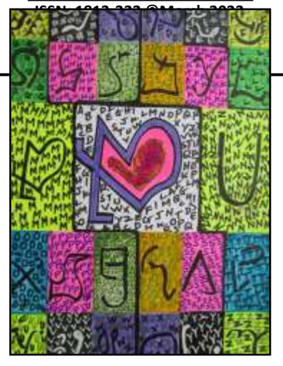
Figure 11: Johnson Ekanem, Medefaidrin upper case, marker inks and glitter glue, 45 cm x 38 cm, 2015