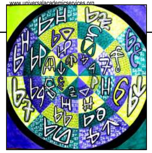
Figure 10: Johnson Ekanem, Medefaidrin numeral design, zero to thirty, reflective and indelible inks, 45 cm x 45 cm, 2019