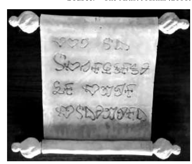
Figure 13: Clement Etim Ekong " Oberi Okaime Alphabets 1" in the scroll's series; Ceramics; 35.5 cm x 44 cm x 6cm; 2013

Figure 12 : Clement Etim Ekong " Oberi Okaime Numerals 1" in the scroll's series; Ceramics; 29 cm x 27 cm x 53.5 cm; 2013