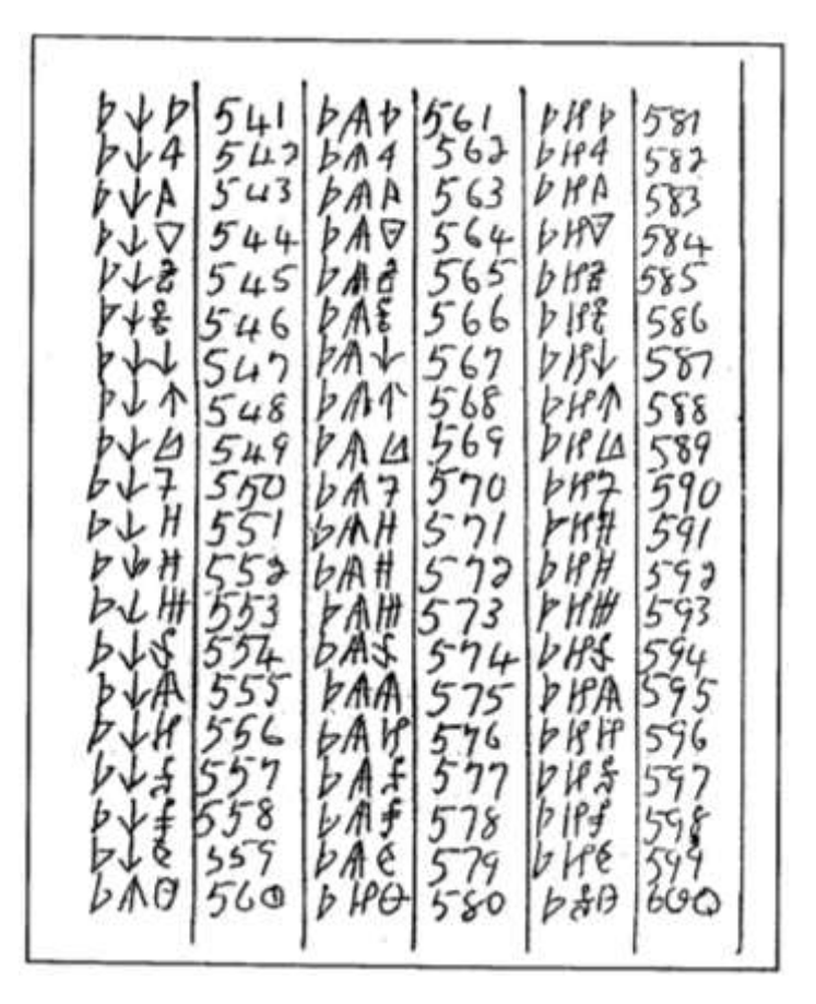
Figure 6: Oberi Okaime Medefaidrin Numerals 541 – 600

LWATI: A Jour. of Contemp. Res. ISSN: 1813-222 ©March 2022 RESEARCH