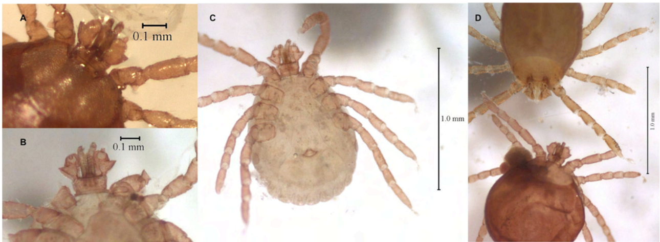
FIGURE 2. A. Dorsal view of the mouthparts of the second haemaphysaline in our sample ( Haemaphysalis cf. simplex ). B. Ventral view of the mouthparts. C. Ventral view of the body. D. Dorsal view of both haemaphysaline species infesting mouse lemurs at BMSR. H. lemuris is pictured at the top.