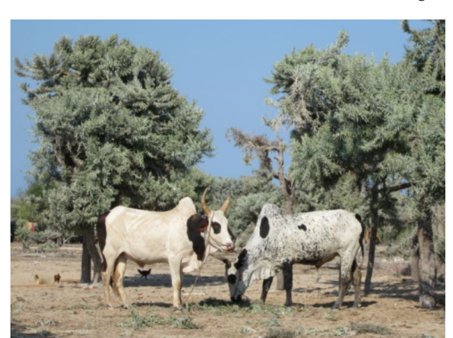
Figure 2: Cattle eating chopped samata (Euphorbia stenoclada).

The social and political organization of the Tanalana and Mahafaly people is based both on the traditional ethnic structure of common ancestors ( raza ) with clans and subordinated lineages,