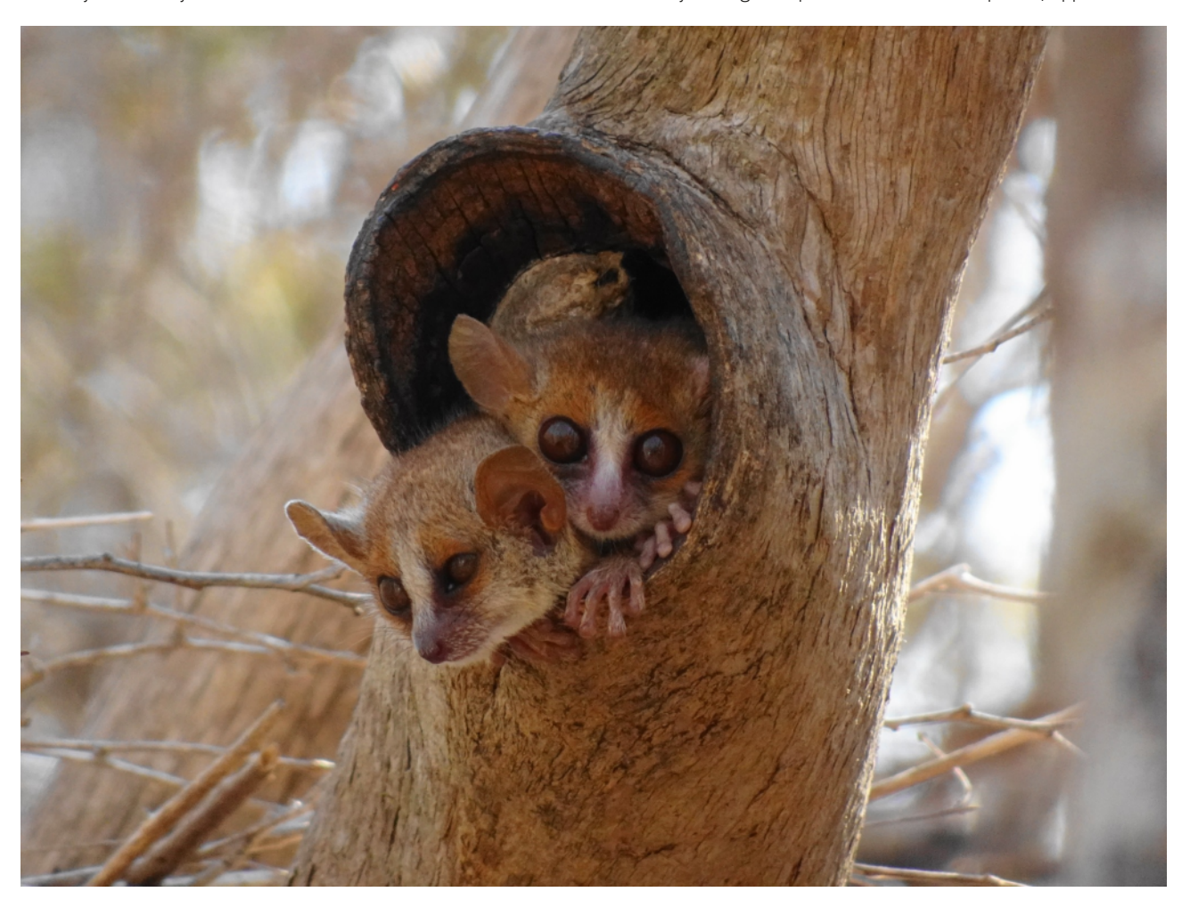
Critically Endangered Madame Berthe's mouse lemur Microcebus berthae is Man's tiniest relative.