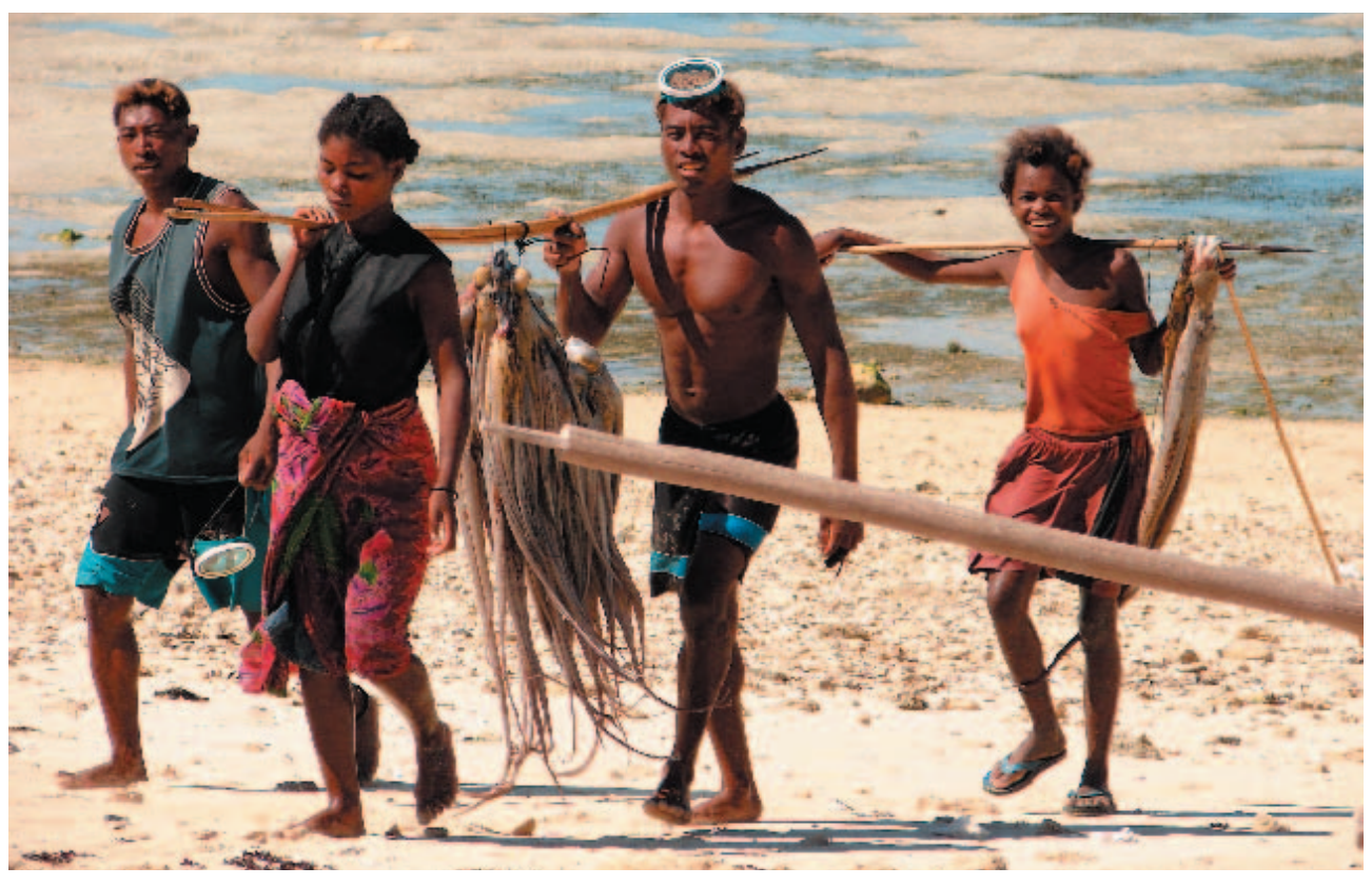
FIGURE 4. Fishers landing catch of Octopus cyanea following reopening of Nosy Fasy no take zone, 2006.

only extractive options for resource utilisation. With a growing market of tourists arriving in Andavadoaka the potential exists to incorporate local villagers into this expanding service industry and for local communities to obtain substantial economic gain in doing so. By demonstrating to local villages that coral reef and other marine and terrestrial resources can be used to generate income from non-extractive activities, whilst also simultaneously achieving conservation and fishery benefits, protected areas have the potential to provide a greater appreciation for, and understanding of, natural resources within the region. The need to develop Velondriake's capacity to receive, host and guide ecotourists has led to the development of a community eco-guide training programme, and plans for construction of a community-run eco-lodge, which will be fully owned and managed by the village of Andavadoaka, and occupied in part by visitors brought to the region by Blue Ventures' existing ecotourism programmes, which currently account for over 7,000 tourist-nights to the village each year.