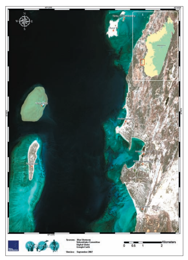
FIGURE 2. Location of the trial octopus no take zone at Nosy Fasy.

The primary goal of the no take zone (NTZ) was to trial a conservation intervention that might serve to improve the sustainability of reef octopus Octopus cyanea, the village's most important commodity. Village elders and local fishers combined their traditional knowledge of fishing activities with fisheries data collected by Blue Ventures to implement a seasonal fishing ban aiming to allow octopus to grow in size and number, in order to produce greater yields for local fishers when the ban was lifted. Results from the first experimental closure, implemented between November 2004 and June 2005, showed that the number and average weight of octopus caught by villagers was significantly greater after the closure and when compared to control sites (Humber et al. 2006). In addition the Ministry of Fisheries consulted project results in creating new fisheries legislation for an annual six-week closed season for octopus fishing across the southwest of Madagascar country starting in December 2005.