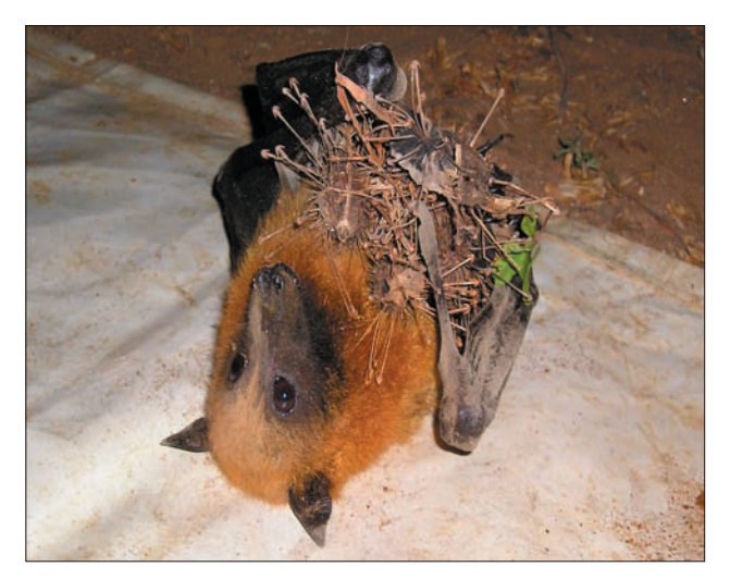
FIGURE 2. Pteropus rufus snared using hook-like plant burrs whilst feeding on kapok trees near Kirindy-Mite National Park