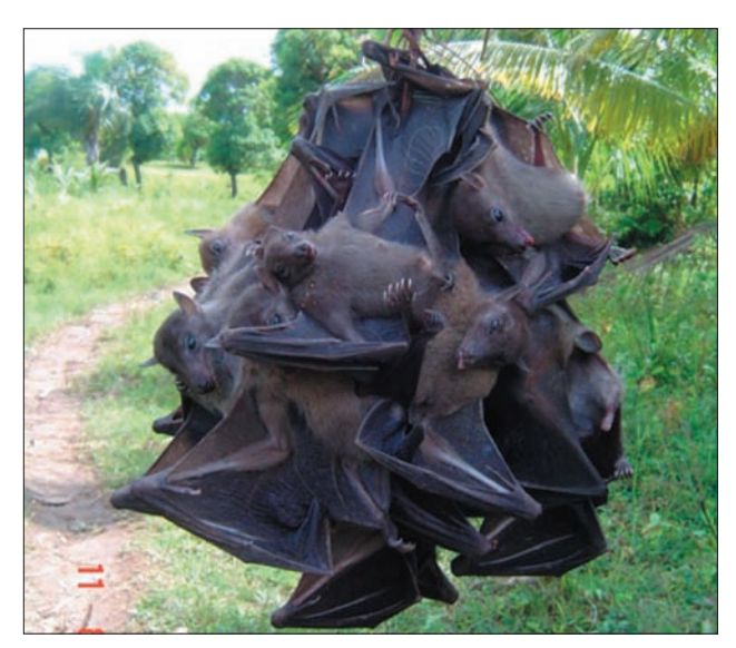
FIGURE 4. The results of a daily hunting trip to a cave roost of Rousettus madagascariensis on Nosy Boraha.

BATS AS BUSHMEAT There are few eye-witness accounts from biologists on the seasonality and frequency of hunting or the destination of the bat meat, and most reports are based