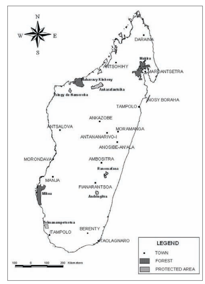
FIGURE 1. Map of Madagascar showing the location of protected areas and towns names mentioned in the text and Table 1.

In this review we collate data on bats as bushmeat, both published and unpublished, and report on general trends with respect to hunting methods, consumption patterns, conservation threats and human livelihood issues. We draw on personal experience in the field since 1998 (PAR) and 2002 (RKBJ) and have augmented the accounts by personal reports from our Malagasy colleagues engaged as either employees or students in successive projects organized by the University of Aberdeen and funded by the Darwin Initiative (1999-2005). Information on bat hunting was obtained through direct observations as well as informal discussions with people in a range of sites across the island (Figure 1).