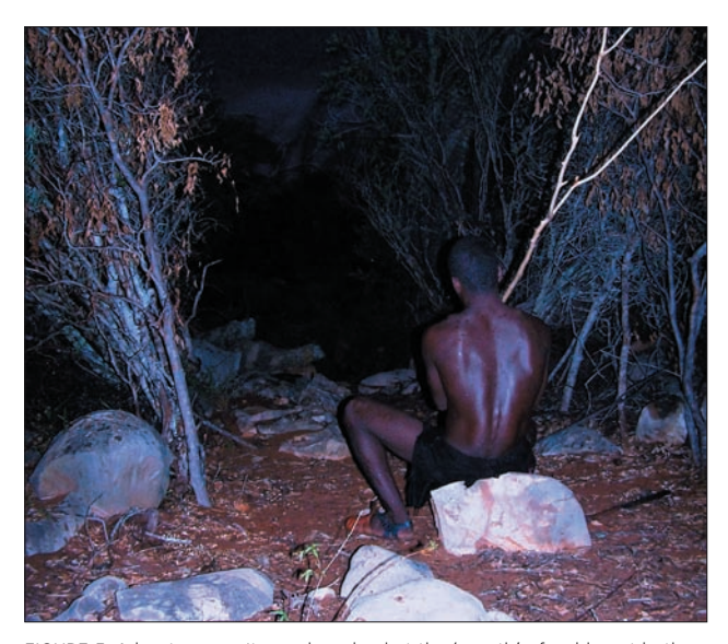
FIGURE 5. A hunter near Itampolo poised at the 'mouth' of a ride cut in the forest from the cave to channel the emerging Hipposideros commersoni towards his long stick.