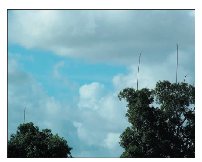
FIGURE 6. Support poles for nets set permanently around the edge of a Pteropus rufus roost in western Madagascar.

on informal interviews (Rakotoarivelo and Randrianandrianina 2007, Rakotonandrasana and Goodman 2007) or brief observations (Goodman 2006). Quantitative information in particular is lacking and this prohibits a thorough assessment of sustainability. Nevertheless, it is possible to obtain an overview of the way in which bat bushmeat is traded and used in Madagascar.