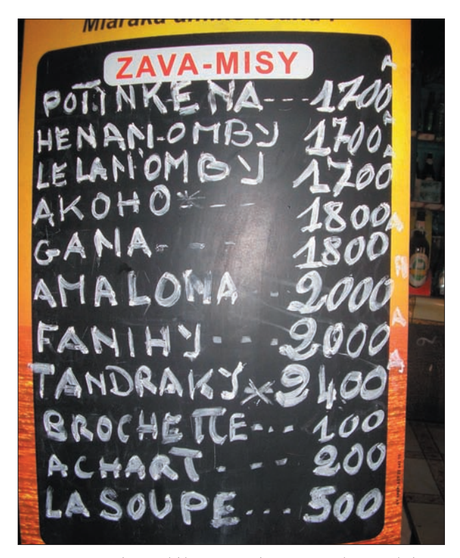
FIGURE 7. A menu in a roadside restaurant in western Madagascar during July 2007 showing the price of fruit bat fanihy as 2,000 ariary or $1 US. Other meats on the menu are omby (beef), akoho (chicken), gana (duck), amalona (eel) and tandraky (tenrec).

THE IMPACT OF BAT HUNTING Rakotondravony (2006) considered hunting to represent a minor threat to P. rufus in the north of Madagascar, but noted that this species was frequently served in local restaurants. Other evidence suggests that, at last locally, current patterns of exploitation are unsustainable and this is obviously of concern to conservationists and those who depend on the bats for income and nutrition. Local