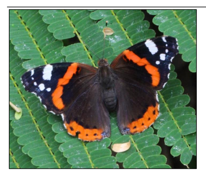
Figure 11 – Vanessa atalanta, Santiago.

In June and July A. moriqua was rather uncommon on most islands. For example, very few were seen at all on São Vicente, despite a proliferation of Acacia flowers; the same was true on Santo Antão, and on Sal, none at all were seen until our last day on the island. Conversely, it was swarming in very large numbers on the numerous Acacia trees that border the long road to Cachaço (Fig. 12). Acacia trees planted to resist the effects of soil erosion are of little nutritional value to the island's goats but provide perfect conditions for A. moriqua . A number of individuals were caught and released, in the hope of finding the other Azanus species that occur on Cape Verde, but all those examined were A. moriqua .