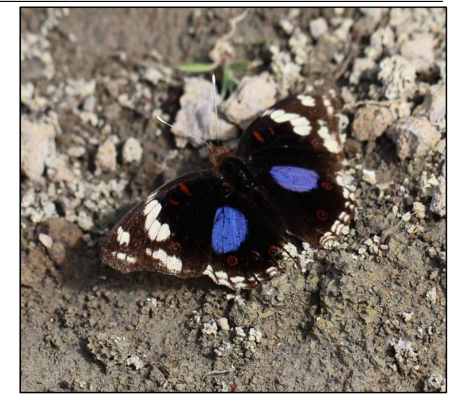
Figure 8 – Junonia oenone, Santiago – first record from the Cape Verde islands.

However, on 30^{\text{th}} June, in our intensive search for Leptotes pirithous (Linnaeus, 1767) we stopped arbitrarily in a roadside ribeira some two kilometres west of Calheta de Sao Miguel (east of Assomada) and discovered that we had inadvertently stumbled across a thriving colony of J. oenone . This was a dry habitat across the road from a deep, cultivated area (Ribeira dos Flamengos) with a ridge behind it; we did not have the opportunity then to fully investigate the area, but returned on 16^{\text{th}} November, when