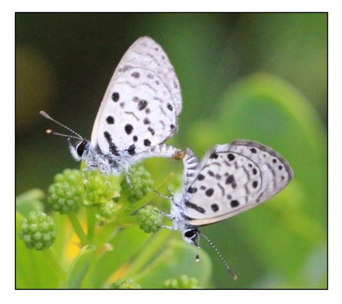
Figure 12 – Azanus moriqua , pair in copula on golden ball Acacia, Santa Antão.

In June and July A. moriqua was rather uncommon on most islands. For example, very few were seen at all on São Vicente, despite a proliferation of Acacia flowers; the same was true on Santo Antão, and on Sal, none at all were seen until our last day on the island. Conversely, it was swarming in very large numbers on the numerous Acacia trees that border the long road to Cachaço (Fig. 12). Acacia trees planted to resist the effects of soil erosion are of little nutritional value to the island's goats but provide perfect conditions for A. moriqua . A number of individuals were caught and released, in the hope of finding the other Azanus species that occur on Cape Verde, but all those examined were A. moriqua .