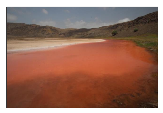
Figure 2 – Pedra de Lume, salt pan inside the crater on Sal.

The authors expressed a belief (Tennent & Russell, 2015a: 72) that the salt pans inside the Pedra de Lume on Sal (Fig. 2) included habitat typical of that which supported a croceus colony on Maio, and – since there was plenty of a potential host-plant, Lotus brunneri , and large swathes of Sesuvium portulacastrum providing nectar – we were surprised not to see the species there in 2013.