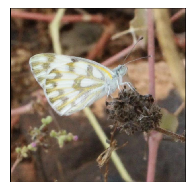
Figure 3 – Pontia glauconome, Boa Vista.

these islands requires confirmation. They are not incorporated in our updated distribution table.