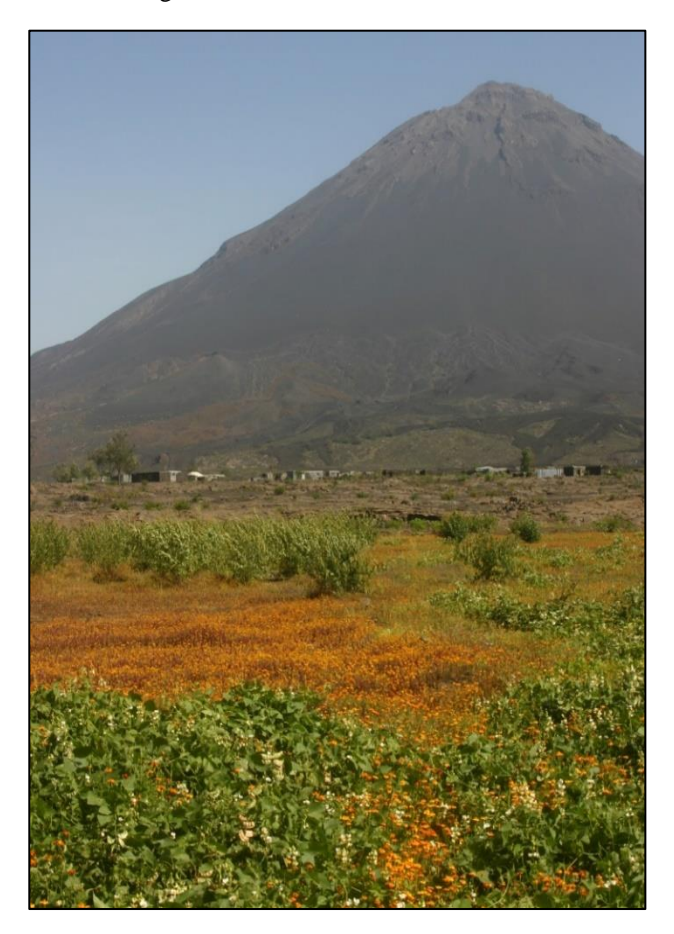
Figure 5 – Cajan beans with Pico de Fogo in background (2013).

Brooke & Gregory (2017) reported "small numbers recorded from mid-November [2016] with an ovipositing female witnessed on one occasion" on Raso island. This is the first record of the species from that island and illustrates both the value of regular visits to remote uninhabited islands, and the ability of butterfly species to take advantage of suitable local conditions.