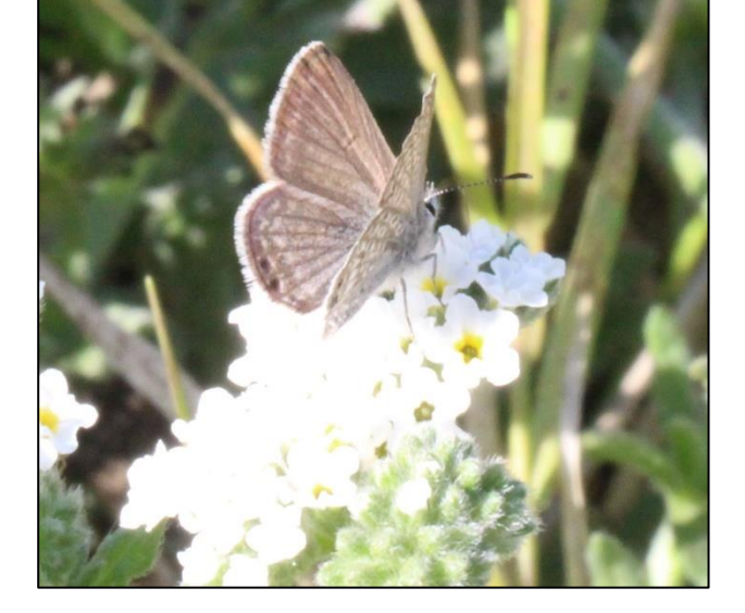
Figure 4 – Chilades evorae , Santo Antão – the only endemic Cape Verde butterfly.

Cape Verde Islands' distribution: Recorded from the islands of Brava, Fogo, Santiago, Maio, Boa Vista, Sal, São Nicolau, Raso , São Vicente, and Santo Antão.