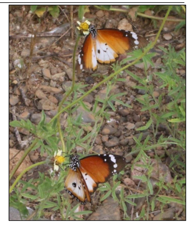
Figure 7 – Danaus chrysippus f. alcippus, Maio.

A solitary male Hypolimnas misippus (Linnaeus, 1764) seen on the summit of Mount Gamboa on Santiago on 1<sup>st</sup> July was the only example of this species seen on our early visit in 2017. Three males on São Nicolau towards the end of November, and a male seen on Santiago on 3<sup>rd</sup> December were the only individuals seen on our second visit. No females were encountered.