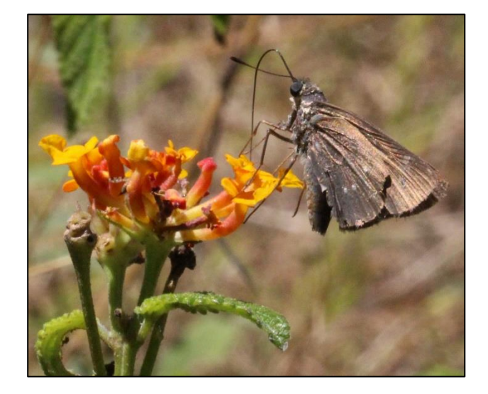
Figure 10 – Borbo borbonica on Lantana, Fogo Island.

It was also quite frequent on the road to Monte Verde on São Vicente. On Santo Antão it was common on the roads around Alto Mira early in July; it was also common on Santo Antão in November.