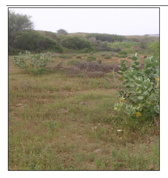
Figure 6 – Maio Acacia scrub with Danaus chrysippus hostplant, Calotropis procera .

But this was not borne out by our observations in 2017 – for example, D. chrysippus phenotypes on Santo Antão were fundamentally brown ( i.e. lacking the ' alcippus ' white hindwing), as they had been in 2013 – on every other island, forms referable to alcippus were prevalent (Fig. 7). Only a small number of larvae were observed on Calotropis in early November, before the chrysippus population had managed to gain a major foothold.