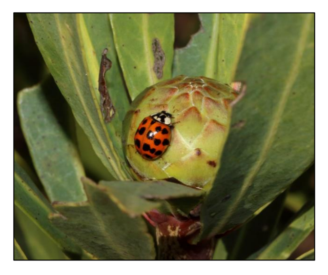
Figure 8 – Harmonia axyridis photographed at Mount Shannon on a flower bud of a Protea caffra .

current Red List status of C. penningtoni is Critically Endangered (Armstrong, 2016).