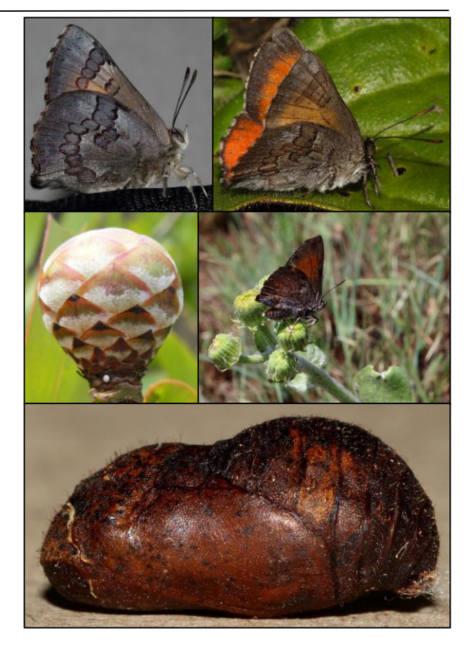
Figure 7 – Proof of occurrence of Capys penningtoni at new sites: Mount Shannon (top left), Nkawini Mountain (top right), Cottingham (middle left), Mt le Sueur (middle right), Clairmont Mountain Nature Reserve (bottom).

Intermittent surveillance for C. penningtoni at eight sites between 2016 and 2020 indicated the persistence of the species at only two of the sites (Bulwer and Nkawini Mountains). At the other six sites, the species was not observed during the surveillance period (Table 3).