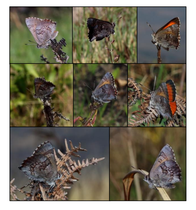
Figure 9 – Eight Capys penningtoni photographed at a site on 17 September 2019.

Continued surveillance of the various subpopulations of C. penningtoni is needed combined with appropriate management of its habitat. Without these actions, the species may inevitably and unknowingly slip to extinction. One glimmer of hope is that the largest number of C. penningtoni yet seen and photographed at one site on a single day by the author (eight, individually identified by the underwing patterns) was observed in September 2019 (Fig. 9). Previously only one individual had been seen by the author there on any one day during the study period. Perhaps the downward trend in the conservation status of C. penningtoni can be reversed.