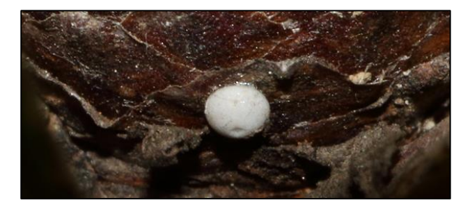
Figure 1 – Egg of Capys penningtoni laid on a Protea caffra host plant bud at Good Hope.