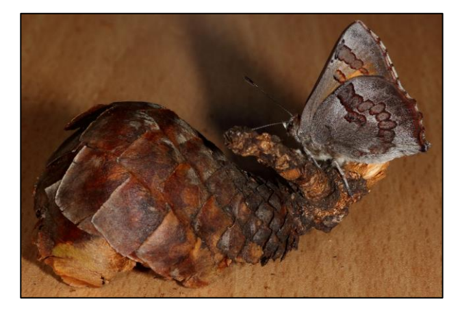
Figure 2 – This male Capys penningtoni eclosed nine months and three weeks after the egg was found at Good Hope and its location recorded. The Protea caffra host plant was revisited the year following the discovery of the egg and the pupa was taken into captivity. The adult was released back at the natal site after eclosure.