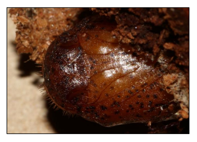
Figure 3 – Pupa of Capys penningtoni from Ivanhoe from which the adult later eclosed.