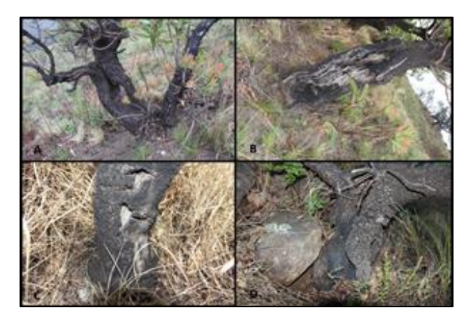
Figure 5 – Evidence of fire damage of Protea caffra tree branches and trunks at A) Clairmont Mountain Nature Reserve; B) Marwaqa Nature Reserve; C) Impendle Nature Reserve; and D) Lotheni Nature Reserve.