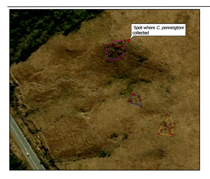
Figure 1 – Delimited patches of Protea caffra (red dots) from 2009 aerial imagery near the spot where a Capys penningtoni specimen had been recorded previously.