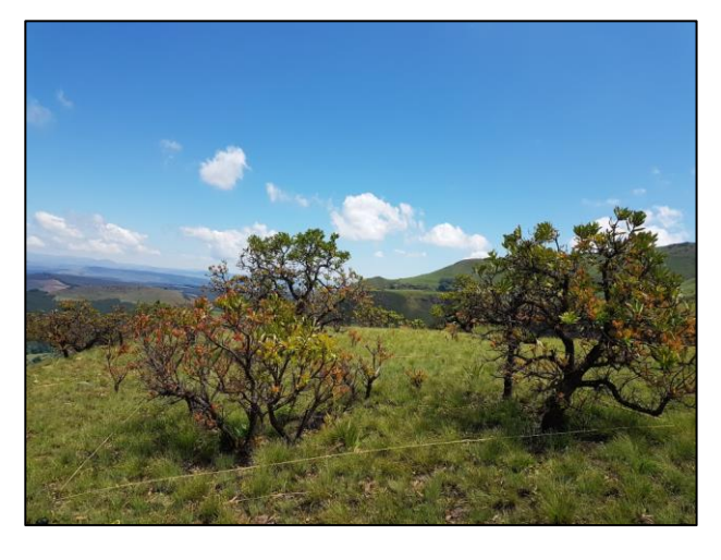
Figure 4 – Harmonia axyridis sampling plot (5 x 5 m) at Marwaqa Nature Reserve.

of P. caffra trees in each differed between the sites, regardless of whether a site had protected area status or not (Table 1). These data also varied in terms of the patches at the same site. For example, for Impendle Nature Reserve, coverage 28 and 67 had more trees (14 and 17) as compared to coverage 68 with a minimum number of 8 P. caffra trees (Table 1).