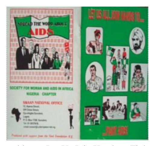
Plate III: A pamphlet on Let Us Join Hands to Fight AIDS

(b) Let Us Join Hands To... (Plate III): Its cover and back page are loaded with many weak illustrations, which create confusion and reduce the impact of the prime message: Let Us All Join Hands To Fight AIDS. Also, the use of red letterings on a green background creates a visual cacophony-a discord that further diminishes the impact of the prime message; and