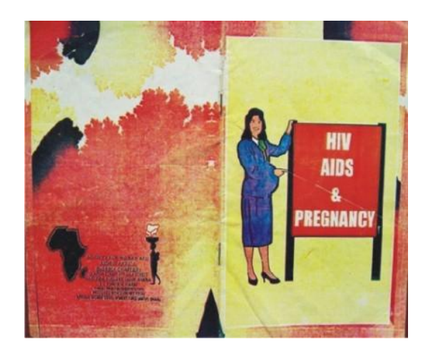
Plate II: A pamphlet on HIV/AIDS and Pregnancy

choice of a White lady on communication materials meant for Black people shows a high level of cultural insensitivity. Surely, there is natural attraction to one's own culture and people.