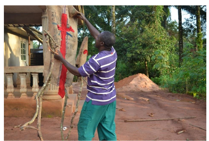
Figure 12: Refraction of Omabe in Stick, Open Compound Space, Ohodo, the Researcher

The approach to work, in this concept, is embedded in telling anything that "you too can be Omabe" and in letting it be so, without considering ethical issues of any kind, as is evident in the present cultural transformation. Conceived forms were manipulated onto objects (figure 12), animals, trees and persons that had less or completely no relationship with Omabe tradition. Manipulation of materials, in this work approach, was mainly by designation and composition; tying, stitching and placing related and unrelated objects together, in unusual positions.