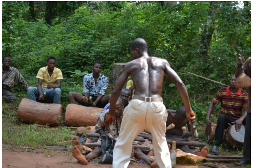
Figure 2: Encounter with Omabe Musical, Oje n'ikpogwu Feast, Umuile, Idi-Opi, 2012

Specifically, Omabe/Odo musicals and festivals were encountered in Ohodo, Opi, Ohebe, Ochima, Obollo-Afor, Leeke-Isi-Uzo, Enugwu-Ezike, Orba, Agbamere-Eharumona, Ishiakpu-Nsukka, Obukpa and Lejja. Photographing of the musical performance was allowed only in few of these places as shown in figures 2 and 3.