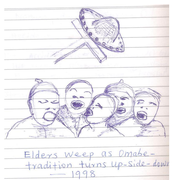
Plate II: Elders Weep as Omabe Tradition Disintegrates, Umuezikenwoke, Ohodo, Sketch, 1998, Researcher's Diary

Through all the methods and processes stated above, contemporary perceptions and conceptions of Omabe tradition in the area were encountered, internalized, and physical forms of it conceived. Thus, the researcher moved into the studio, manifesting Omabe intuitively, in diverse ways.