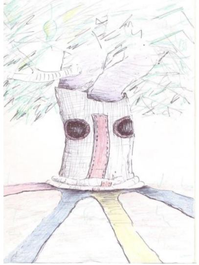
Plate III: Tree and Ground as Omabe-based Installation, Sketch, 2014

Omabe forms and other characteristics, assimilated in this research, were therefore, gazed out directly in trees. A tree on which valid Omabe features were spotted was designated as Omabe-based sculpture installation. In the designation proper, major obstructions were eliminated and little Omabe manifesting objects were introduced on some areas to facilitate communal recognition and appreciation of the Omabe-masquerade features inherent in a tree. Elimination of obstructing part of a tree was mainly by tentative tying, in order not to harm or injure it. In some cases however, sketches were first made to consider relationship of a particular Omabe manifesting objects were searched out, for physical realization of a drawing, considered interesting and valid, in the achievement of the desired goal. Plates III and IV are sketch considerations of Omabe features and attributes in different dispositions of tree: