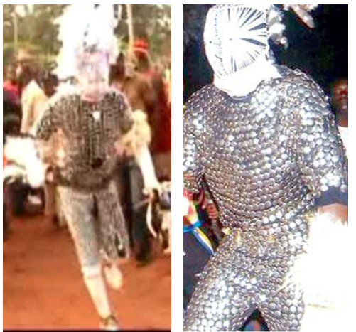
Figure 5: Ujamh/Echaricha/Ugele, Entertainment Masquerade, Omabe

sun's radiance. As Nwoko (1989) observes, the content of the Ugele masquerade derives from the meaning attributed to its elemental forms. For example, the sun-burst motifs of the eye slits which represent the rays of the sun are believed to depict power. Forms of Mgbedike, and Koprh of entertainment Omabe are shown in Figure 6.