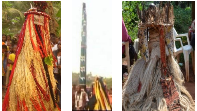
Figure 7: Utobo, Ozigbo, and Udele-Idenyi, Kinds of Ishi-Maa/Ishi-Omabe

hierarchy. Like the Ugele, Agbeji is associated with prestige, peace, elegance and wealth. Although Ishi-maa (figure 7) entertains with great rhetoric and proverbial power, it also acts as law enforcement agent, settling dispute and reconciling people to ancestral protection.