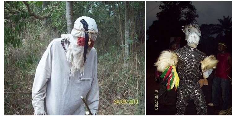
Figure 1: (A); Oriokpa and (B); Ujam types of Omabe , Picture, Michael Widjaja, Retrieved Online, 22/5/2012, <u>http://www.igboguide.org/HT-chapter9.htm</u>

Among the Nsukka–Igbo in Enugu State, Southeastern Nigeria, Omabe was the central visual symbol upon which the people's philosophy and life forces were expressed. Omabe is a culture, centered on the belief on the physical presence of the ancestral spirits, in form of deity. The Omabe deity was represented or given visible form by masquerades, initiated persons and adopted plant and animal objects. It was characterized by periodic festive presentation and performance, for entertainment and chastisement of the people. Aniakor (1978) notes that, Omabe was used as agent of social control, as its forces were harnessed, to check all the excesses of the people. Under its influence, people of all classes were controlled as they shared common belief and common fears.