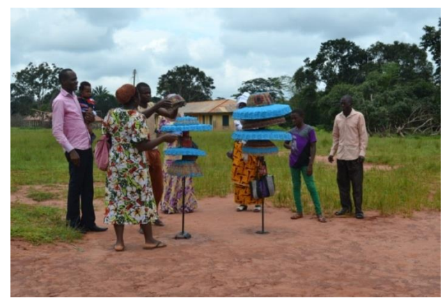
Figure 13: An Installation being Executed in a Field Near Catholic Church, Ohebe-dim

It is important to point out here that there is no finishing in the kind of work executed in this research. A work was suggestively made; just to help each observer reflect a particular side of Omabe and intrinsically complement it, with his or her own details. This way, different images of Omabe would tend to emerge from a particular work; depending on the angle, time and mood it was observed and as such, adjustment was continuous in all the works. Consequently, it also became important that pursuance of this particular objective be continuous with adjustment and fresh execution of Omabe-based installation, in locations and occasions, that could facilitate proper reflection of various stories and images surrounding it. This continuous adjustment could not however, halt development of texts in this research, as preceding exercises, yielded tangible results that satisfied the requirements of the set-objective and aided dissertation compilation.