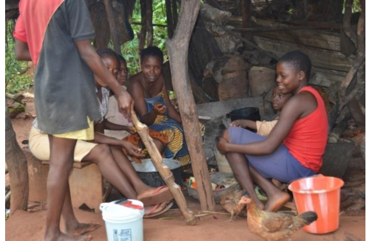
Figure 10: Women Describing Omabe through Kporokpoto, Umu-owula, Ogbozara-Opi

In the conception simulation exercise, people were first asked to identify the object, its use and the user (see figure 10). Those people who identified the objects correctly as symbolic icons of Omabe were asked to metaphorically describe it according to their perception or understanding of the whole of its tradition. According to Baxter et al (2008), metaphoric interpretation leads to conceptual blending, needed in understanding of qualitative research.