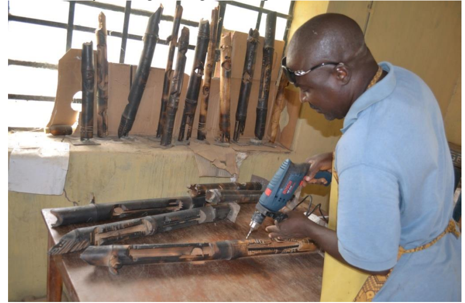
Figure 11: Defining Perceived Forms in Kporokpoto, Sculpture Studio, ABU, Zaria, 2013

"Reviewing Today" is a kind of "refractive gaze", related to direct object exploration. As if today had already been concluded and its result hidden in the ashes of yesterday, contemporary perceptions of Omabe were reflected and refracted directly out of its operating icons, gathered for the research (see figure 11). According to Broad's philosophy of objective reality (Dukor 1994), "knowledge can be acquired by perception of a physical object by means of sensations which the object produces in the mind ..." Being influenced by the contemporary perceptions, the researcher encountered (perceived) elements of the wishes and metaphoric descriptions of the people on the pieces of the gathered Omabe's manifestation objects or icons. Then, the forms identified in each object were defined. Definition of form in this particular exercise was in form of extending further an already distressed part or by placement style. This process of form definition was facilitated by burning, cutting, stitching and attachment.