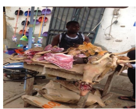
Plate 4. Abuja meat seller