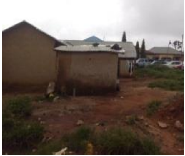
Plate 12. Tale of urban slums in Abuja mega city