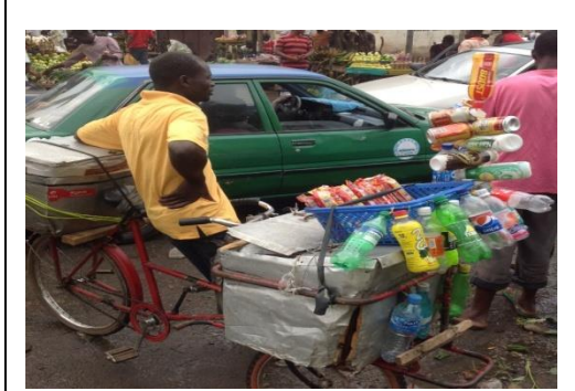
Plate 2. Abuja soft drinks and Gala seller