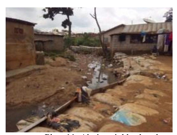
Plate 11. Abuja neighborhood

It is important to realize how these pressures resulting from development, on the urban geography mutually reinforce rather than correct one another. Although cities transform resources in ways that contribute strongly to economic development and social welfare, they also generate waste that pollute the urban-human environment and degrade renewable natural resources. A simple fact in this respect is that, though man's interaction with nature has brought about the formation of urban spaces and centres and their extension, the same process of interaction has also led to the degeneration of the spaces it created (plates 8, 9, 10 and 11). This is an important issue in housing and residential quantity and quality (Okonkwo, 1998, p33-34).