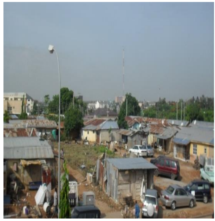
Plate 17. Utako, Abuja Settlement area