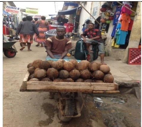
Plate7. Abuja barrow yam seller and other merchants at the background

Keeping and maintaining the government's failed, orthodox housing delivering schemes to the expanding poor Nigerian populations, how can the government, sustainably, provide where the urban poor can live without disturbing the urban equilibrium, knowing that they (the urban poor) have no lands, that they squat anywhere they see and provide services needed to maintain the rich communities?