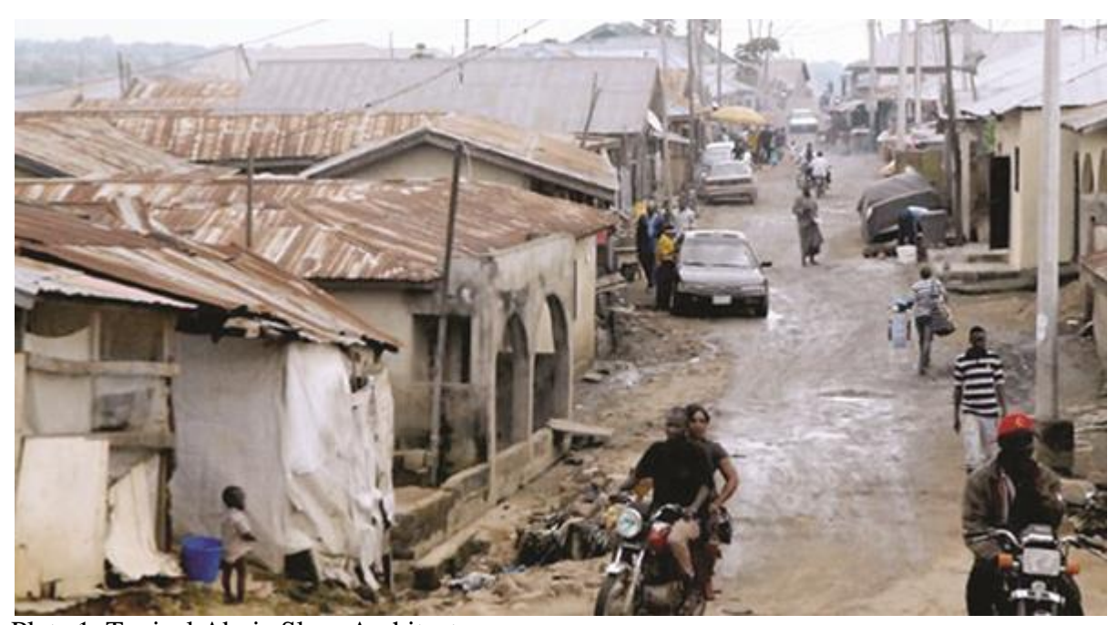
Plate 1. Typical Abuja Slum Architecture

Bello (2009) stated that, generally, as the population and affluence grow, there is an increase in the demand for land by government, private individuals and corporate bodies. Unfortunately, since the physical overall supply of land within a geographical area is fixed, demand always outstrips supply by a very wide margin, especially in the urban centres. This inevitably brings about the survival of the fittest syndrome. In this struggle, government has the upper hand through the exercise of their power of eminent domain, while individuals and corporate bodies meet their land requirements in the open markets. Within the open market, the corporate bodies and the rich individuals usually with higher bargaining power, dominate the transaction; while the urban poor are left with little or no choice but to make do with the crumbs. Consequently, this group of individuals, in most cases, occupies the less desirable areas such as marshy sites, neighborhood adjacent to refuse dumps and where they can find one, they encroach on government lands. The emergent settlement usually evolved as a spatial concentration of poor people in the poor areas of the cities. As expected, this settlement is usually characterized by infrastructure deficiencies, shanty structures, poor sanitation, urban violence and crime. These composition and characteristics have always made squatter settlement a source of worry and concern to their adjacent neighbours and governments (plate 1).