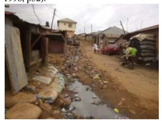
Plate 8. Alum, Mpape ,Abuja

accidents. In poor countries where poor housing structures dominate the urban landscape, spaces are littered with settlements lacking the most basic urban infrastructures (plates 8 to 11). All this tend to reduce the quality of the human environment especially in the urban areas (Okonkwo, 1998, p32).