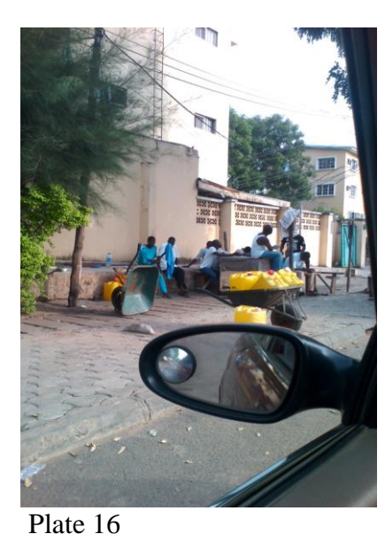
Plate 14. Plate 15. Plates 14, 15 and 16, Abuja's public space (housing/shelter)