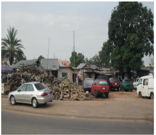
Plate 18. Utako Village, Okonjo Iwulal Way

Whether or not it is clear, urban design can ameliorate the deeper problems of cities. But short of liquidation, what then is the future for urban design? It is arguable that it is ultimately the tasks of managing and improving the spatial dialectics. Expanding the concept of an inclusive, democratic, and civil domain will remain the critical challenge for urban design; the process may begin with solutions that are incremental and marginal in scope, but it must progress with larger vision of what needs to be accomplished (Loukaitou – Sideris and Banerjee, 1998, 308), Sustainable Spatial Housing Design for the Urban Poor in Abuja, Nigeria is thus a documentation/identification of a prevailing urban phenomenon with interest to make remediation recommendations.