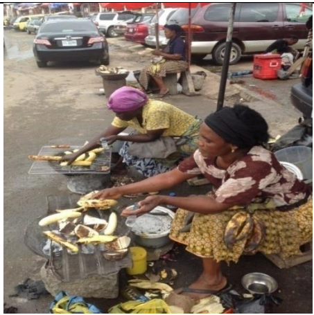
Plate 6. Abuja plantain roasters