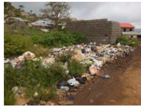
Plate 9. Berger Quarry Abuja