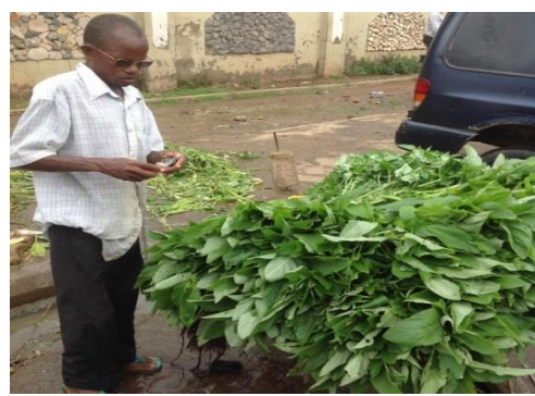
Plate 3. Abuja vegetable seller