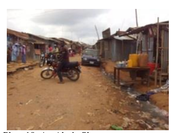
Plate 10. An Abuja Slum