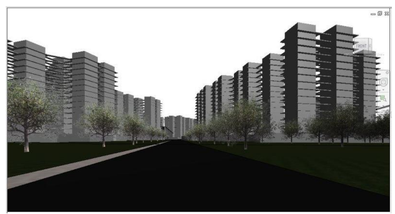
Plate 21. Recommended model for Abuja Spatial Housing Design (perspective –a different view)