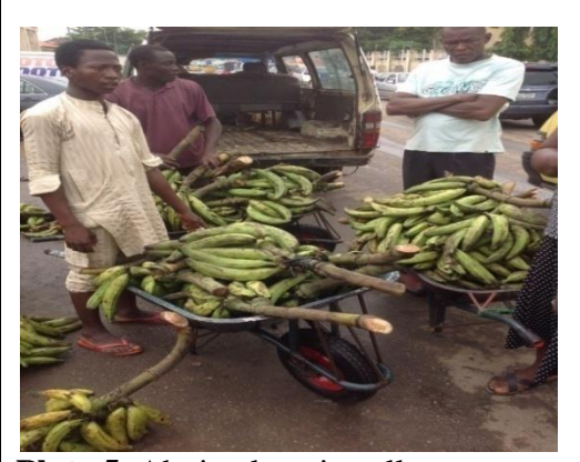
Plate 5. Abuja plantain seller