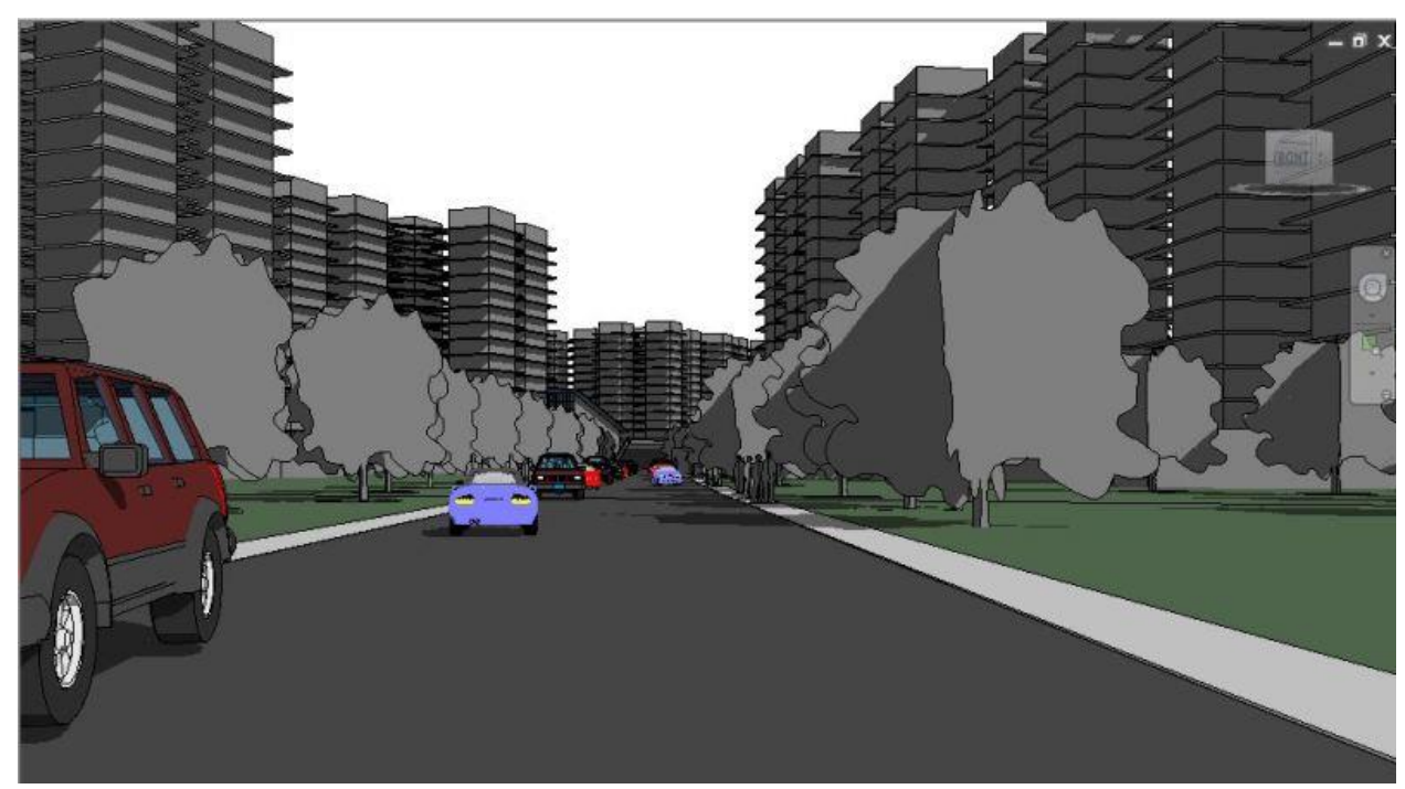
Plate 20 Recommended model for Abuja Spatial Housing Design (perspective).