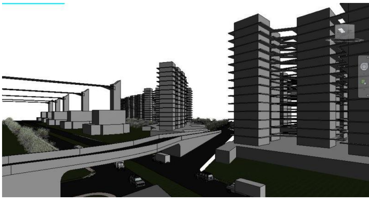
Plate 22. Recommended model for Abuja Spatial Housing Design (perspective-a different view showing urban the elements).