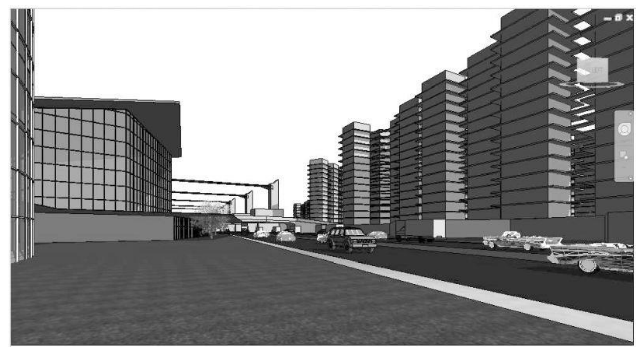
Plate 23 Recommended model for Abuj Spatial Housing Design (perspective – showing a landmark).