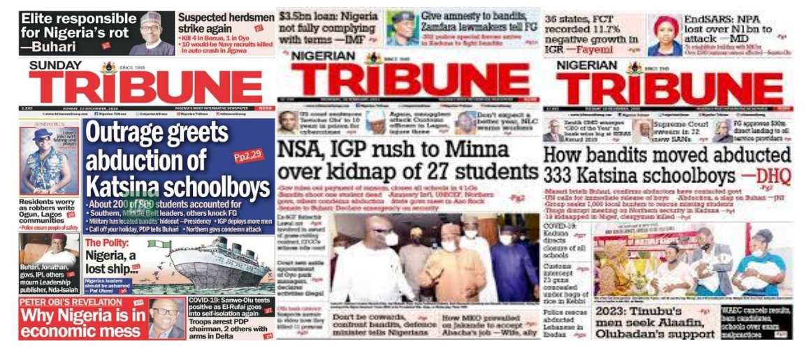
Dec 13, 2020 Feb 18, 2021 December 15, 2020