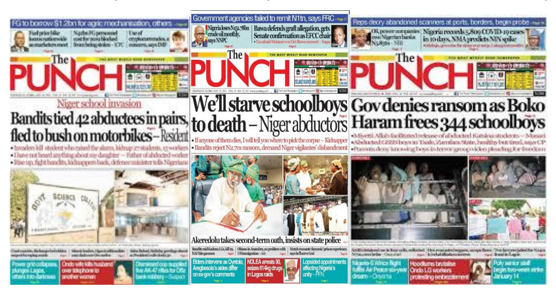
February 18, 2021