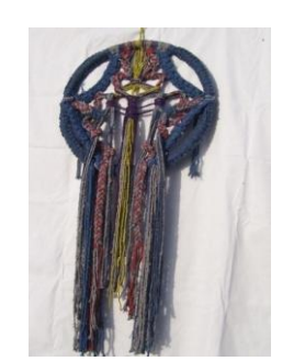
PLATE. 9 ISI NWAOJI