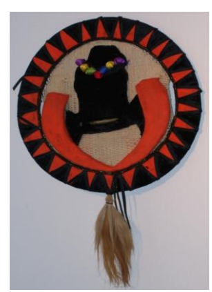
PLATE. 4 AUTHORITY SYMBOL