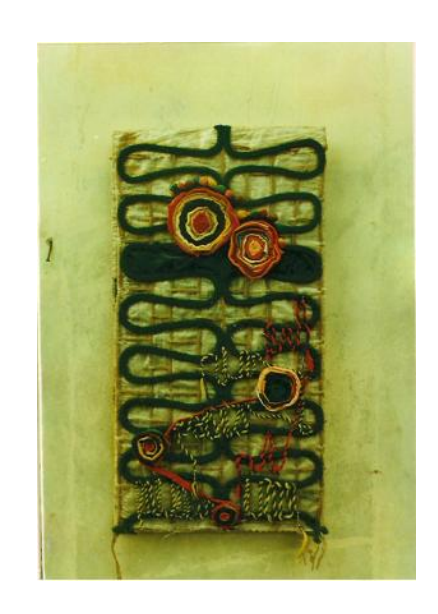
PLATE. 2 THE ROYAL AND THE SUBJECTS