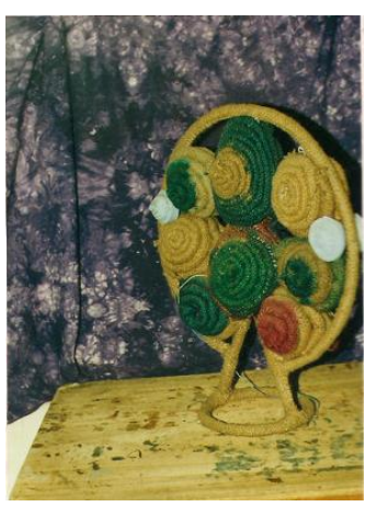
PLATE. 3 NIPPLES OF GENERATIONS