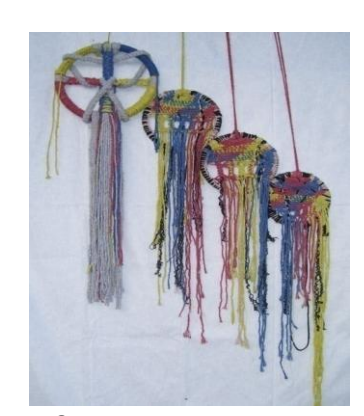
PLATE. 8 THE WAY WE ARE