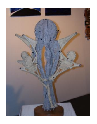
PLATE. 7 A CRY FOR HELP