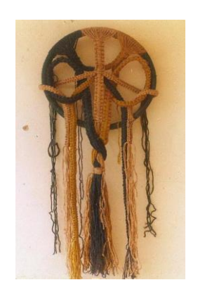
Plate. 6 UNITY IN DIVERSITY