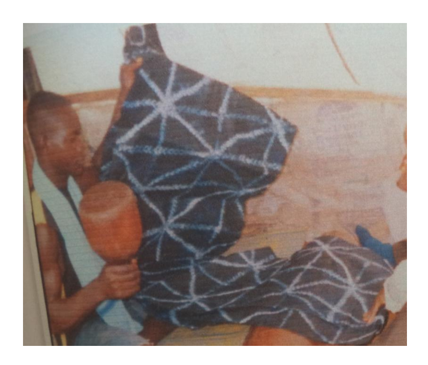
Plate 4: calendared Adire fabric.

Differences between the local Jukun Adire with the Studio experimented Jukun Adire fabric production: