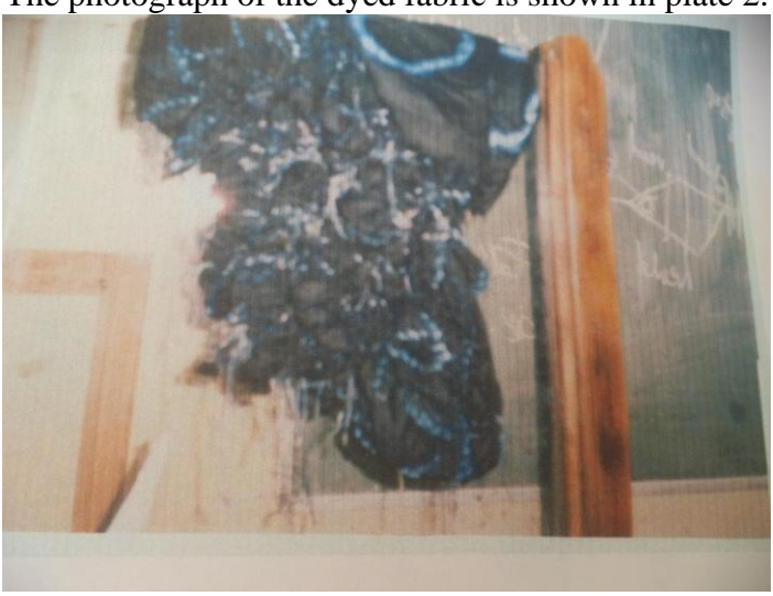
Plate 2: untied stitches

The stitched thread is firmly pulled or tied together then the fabric submerged into the dye liquor. The photograph of the dyed fabric is shown in plate 2.