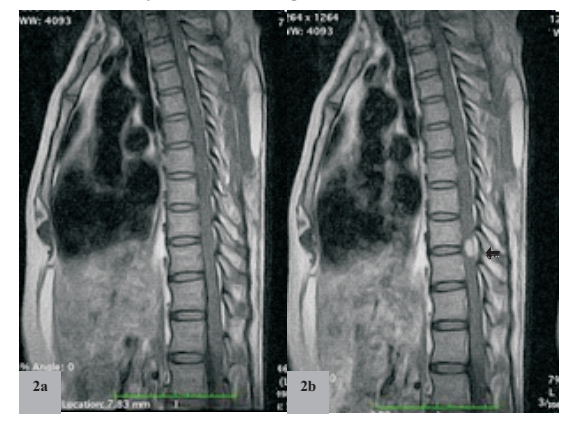
Figure 2: Preoperative thoracic spine magnetic resonance imaging of the second patient.

50-year-old right handed man who presented with low back pain and progressive paraparesis of eighteen months, and three months, duration respectively. He had no co-morbidities. Examination revealed a middle-aged man with normal general examination findings. His long tracts were normal in the upper limbs. He had a spastic paraparesis with power being grade 4<sup>-</sup> to 4<sup>+</sup> in the right lower limb and 4 to 5 in the left lower limb. Sensory level was T7 bilaterally with residual to S4 and S5. Magnetic resonance imaging of the thoracic spine revealed a T9/T10 contrast-enhancing intramedullary tumour (Fig. 2).