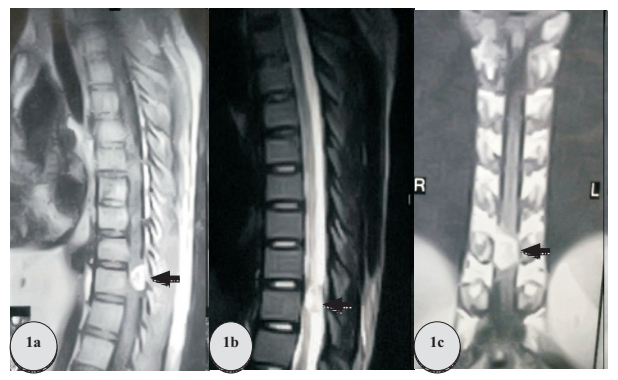
Figure 1: Preoperative thoracic spine magnetic resonance imaging of the first patient (black arrow on the intradural-extramedullary tumour).

25-year-old right handed female who presented with right flank pain, numbress and paraesthesia of the lower extremities of two weeks' duration. She developed progressive paraparesis about ten days later. Her symptoms were not associated with sphincteric dysfunction. Examination revealed full power in the upper extremities. She however had a spastic paraparesis which was significantly worse on the right (grade 1-3), hyperreflexia (worse in the lower limbs) and sustained ankle clonus bilaterally. Her plantar response was extensor on the right and flexor on the left. She had a sensory level of T9. There were no features suggestive of VHL. Magnetic resonance imaging of the thoracic spine showed a T10 intradural-extramedullary lesion (Figure 1 a-c).