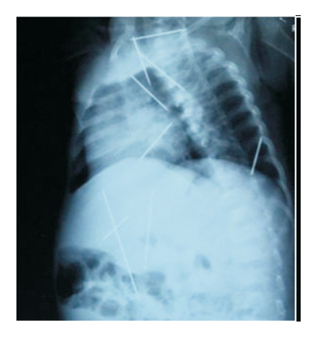
Figure 3: Lateral projection of the chest showing needles and wires