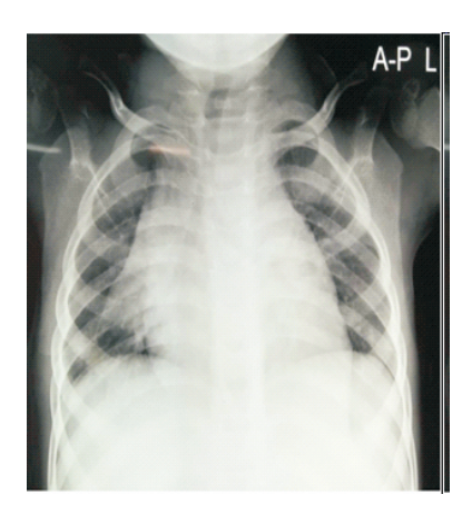
Figure 10: Post-surgery AP projection of the chest

After imaging, a multi disciplinary team was constituted consisting of radiographers, radiologists, paediatric surgeons, paediatricians, nurses, and anaesthetists to remove the remaining needles in the chest, and abdomen. After careful planning, the remaining foreign bodies were removed by the surgeons under image intensification operated by imaging professionals. Figures 10 and 11 show post-surgery images of the chest and abdomen.