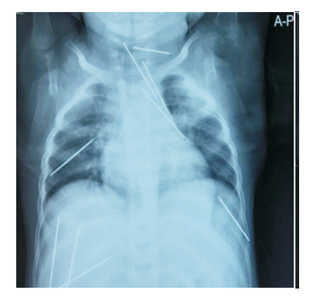
Figure 2: AP projection of the chest showing needles and wires