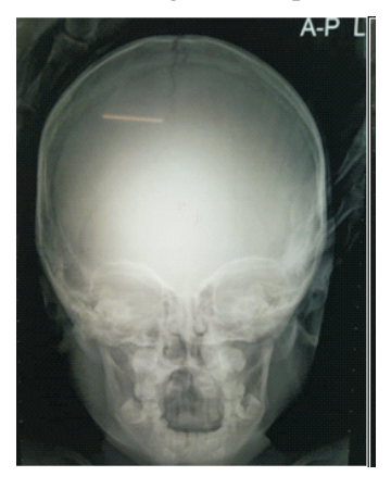
Figure 1: AP projection of the skull showing a wire on the right side

reported by a Consultant Radiologist and diagnostic report sent to the referring medical practitioner.