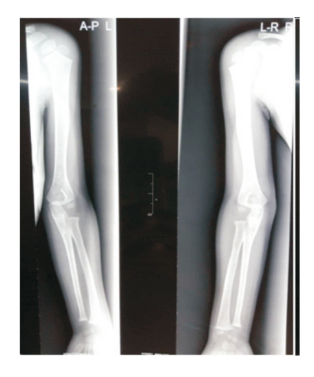
Figure 6: Plain images of the upper limb