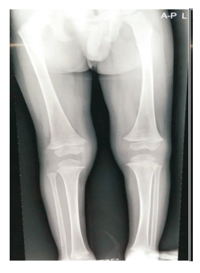
Figure 7: Plain images of the lower limb

After analysing plain film radiographs and the final diagnostic report, the attending medical and surgical