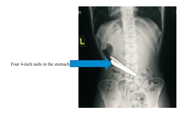
Figure 2; Abdominal x-ray showing nails in the stomach without gastric perforation.

X-rays revealed a metallic a tablespoon in the third part of the oesophagus and four 4-inchnails in the stomach, as shown in Figure 2.