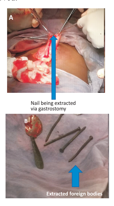
Figure 3; Showing a gastrostomy in (A) and extracted foreign bodies in (B).

Four 4-inch nails were extracted from the stomach. A Magill forceps was used to remove the spoon (3cm wide) from the oesophagus, located about 5cm from the gastroesophageal junction. Figure 3 shows the laparotomy, gastrostomy and foreign bodies that were removed.