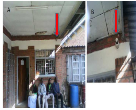
Figure 2: Improperly placed exhaust ducts at Limbe Health Centre.

At Lirangwe Health Centre, there was no electricity