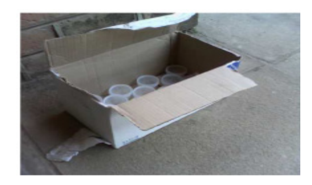
Figure 1: Improvised transportation boxes

Chileka Health Centre had no disinfectants. The already prepared reagents were not properly labeled. And the biosafety cabinet was not working properly.